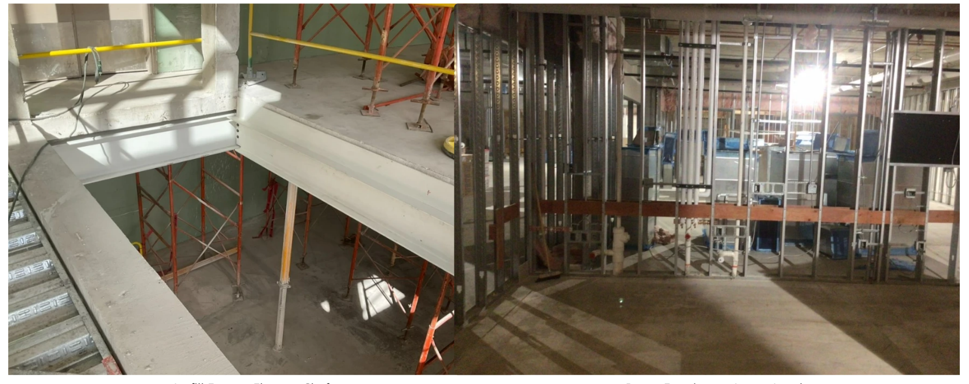
In-fill Former Elevator Shaft