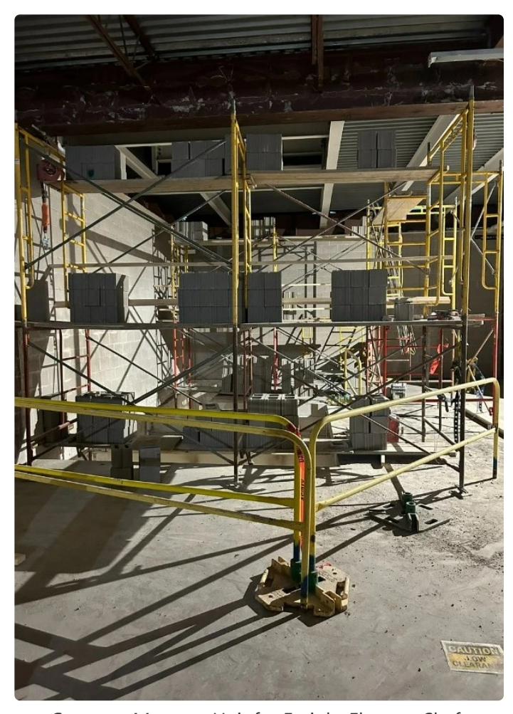
Concrete Masonry Unit for Freight Elevator Shaft