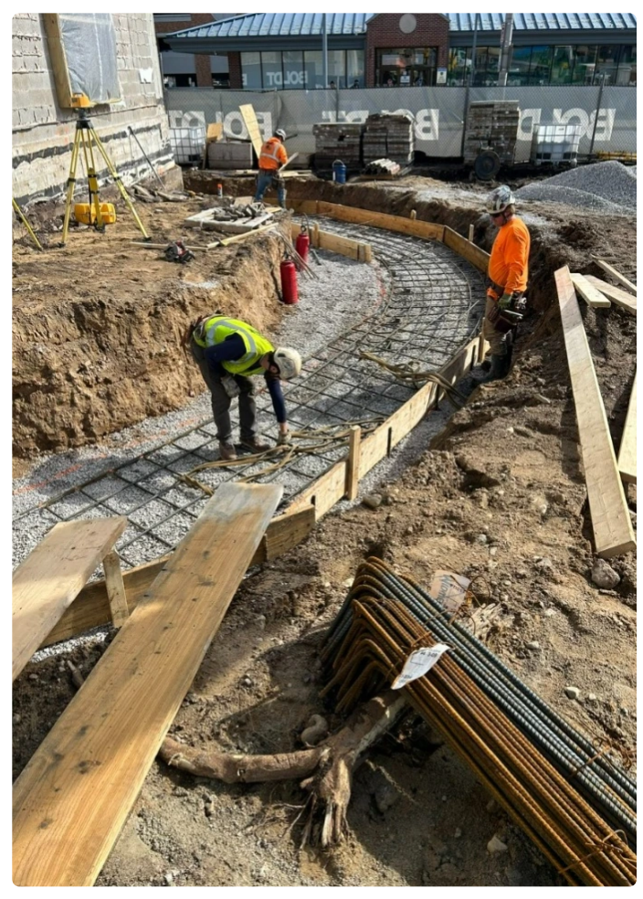
Children's Terrace Footings