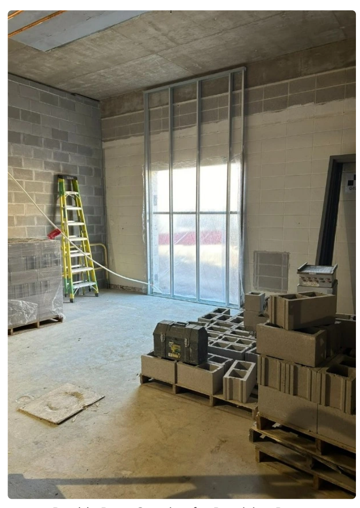
Double Door Opening for Receiving Room