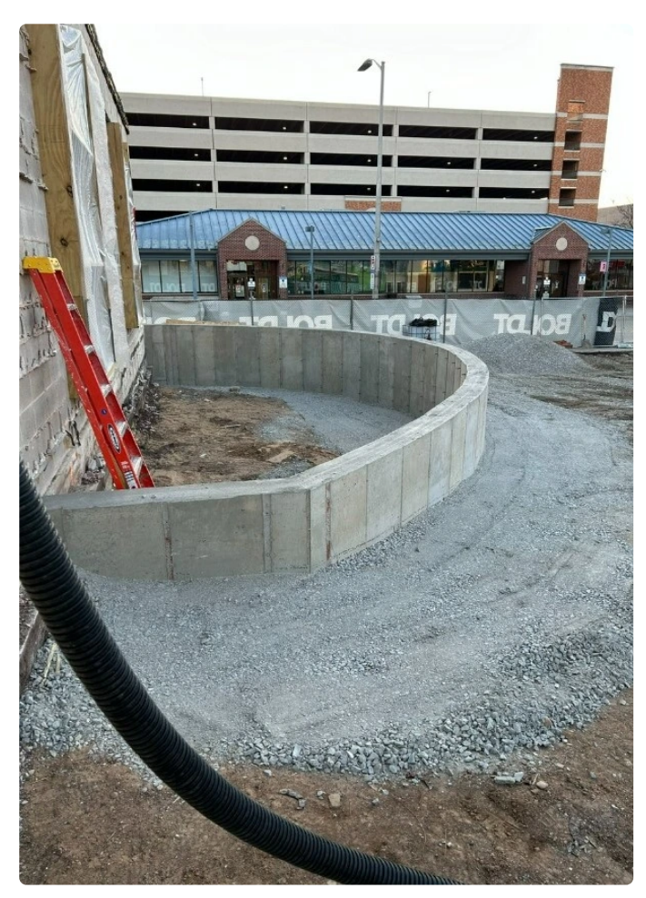
Children's Terrace Foundation