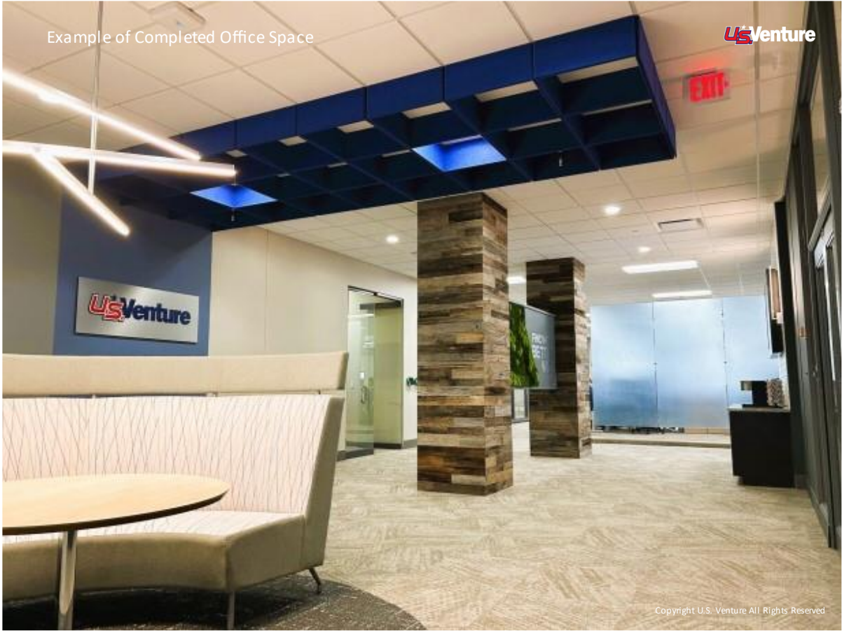
Example of Completed Office Space

Copyright U.S. Venture All Rights Reserved