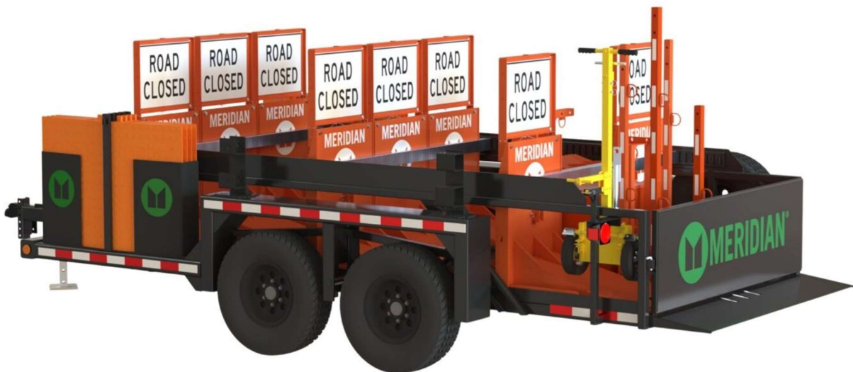
Archer Hauler 2.0

Meridian Trailer (Note – Appleton’s system would not include sign holders or “road closed” signs; we intend to use a combination of existing city-owned barricades or event-provided barricades outside the Meridian barrier perimeter)