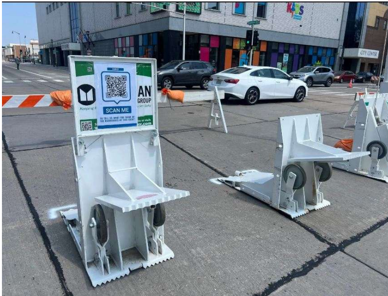
Archer 1200 Barrier – Appleton Field Test