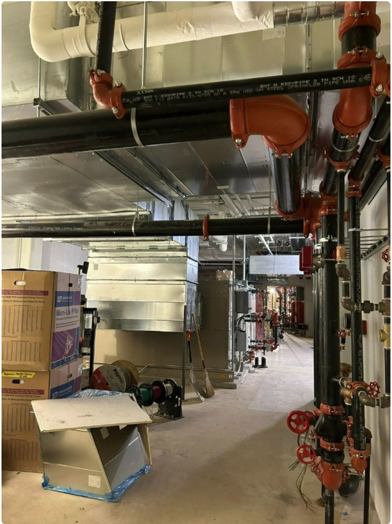
Lower-Level Air Handling Unit in Mechanical Room