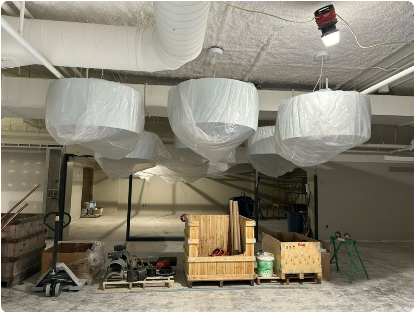
Lower-Level Light Fixture Install