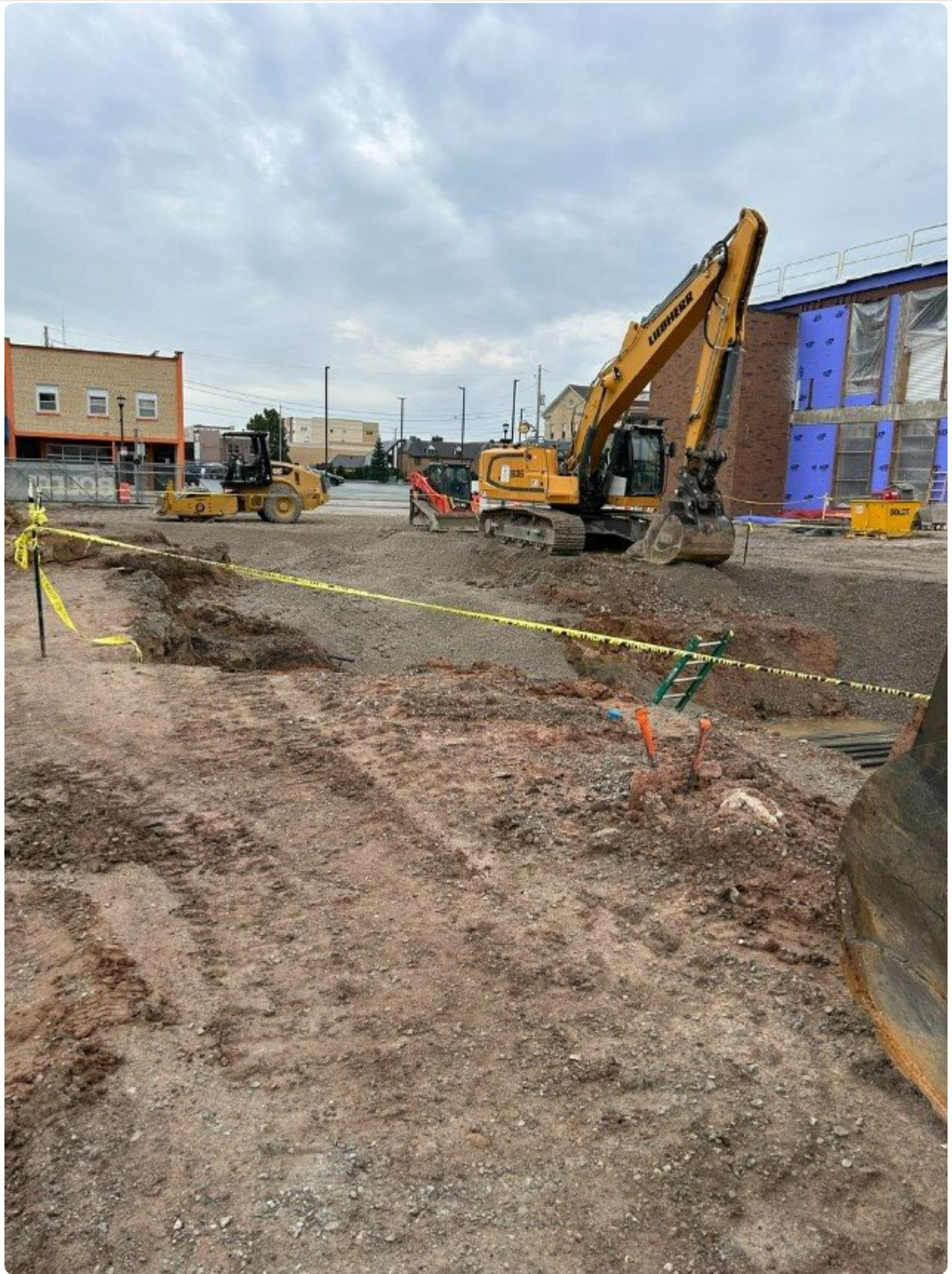
Geothermal Header Work