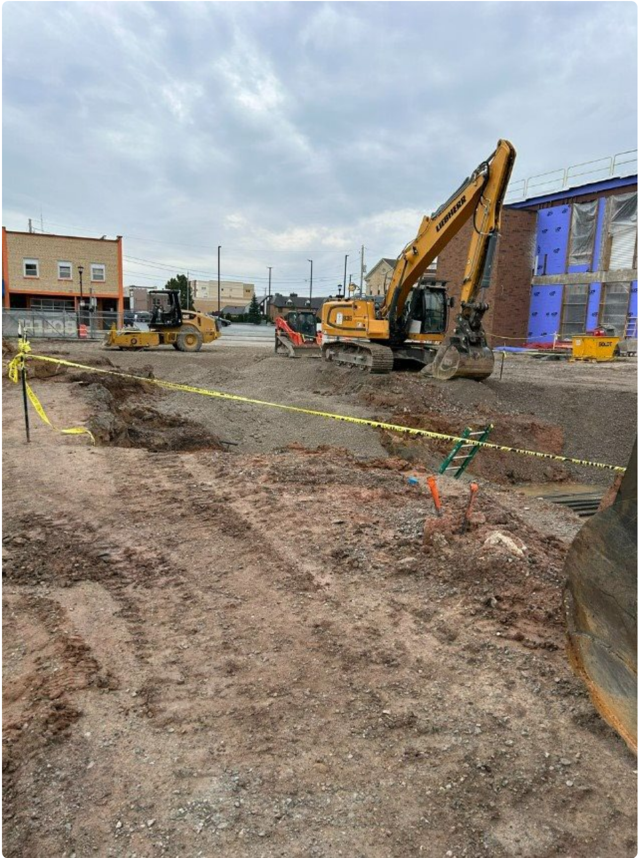
Geothermal Header Work