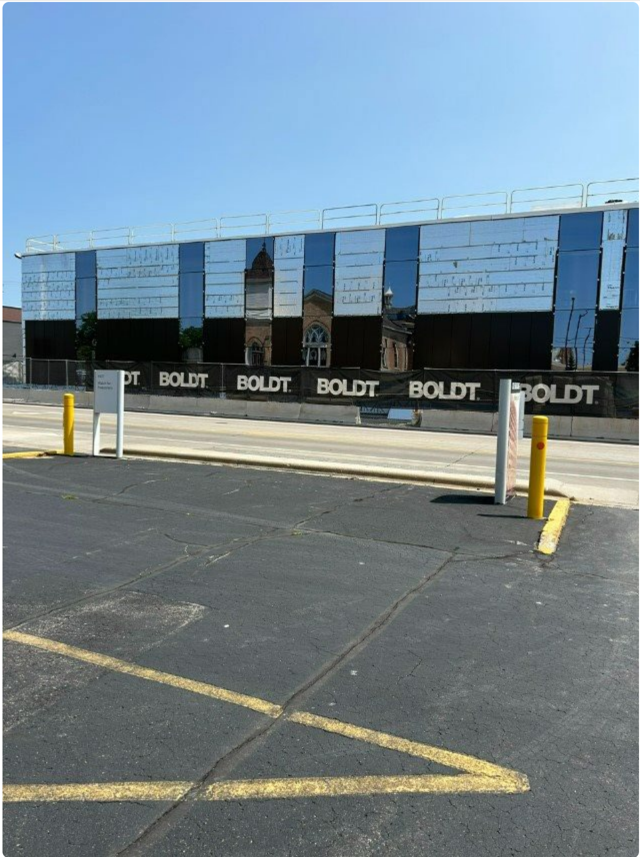
West Side Window and Metal Panel Installation