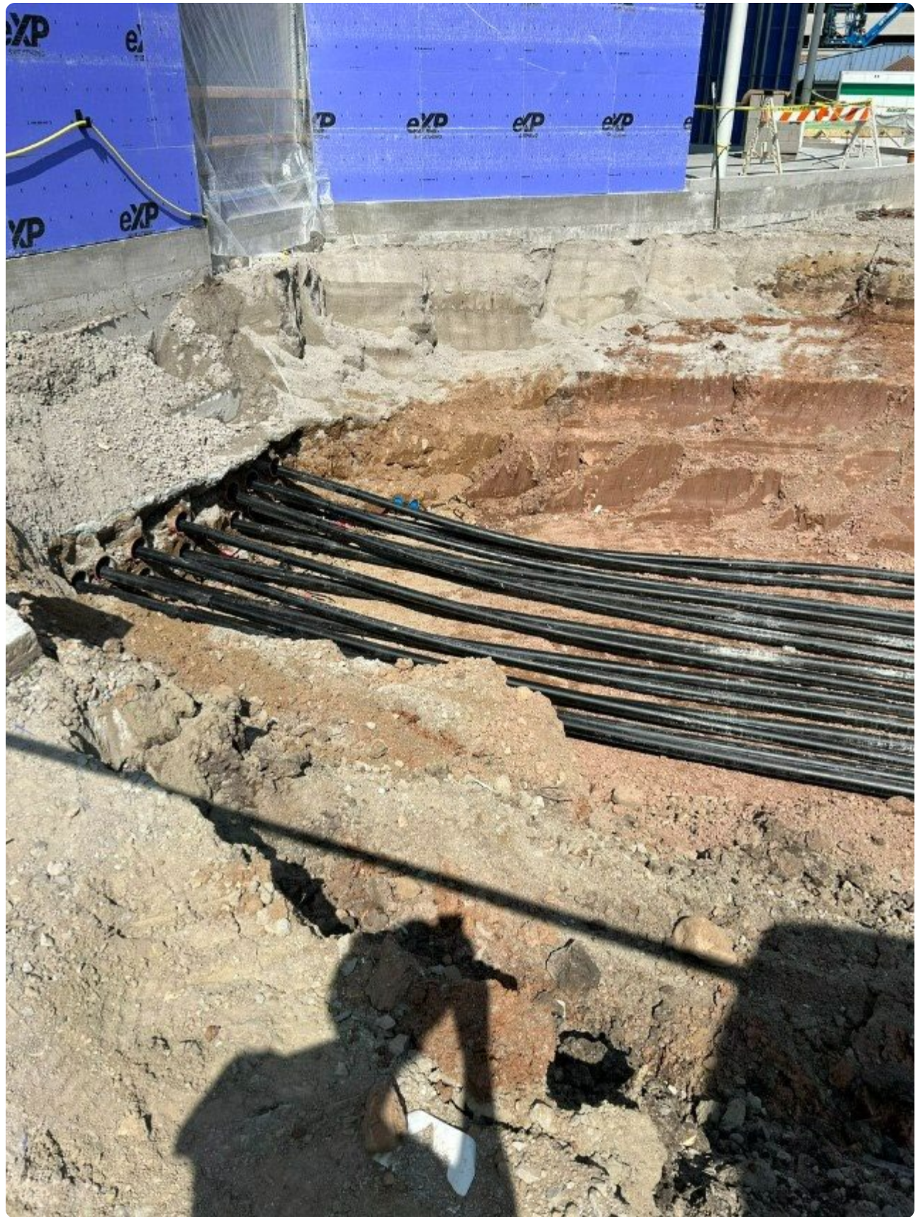
Geothermal Tubing from the Building to the Parking Lot