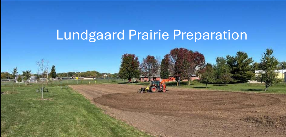
Lundgaard Prairie Preparation