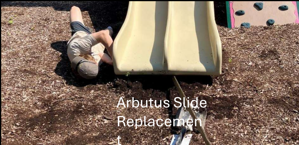
Arbutus Slide Replacement