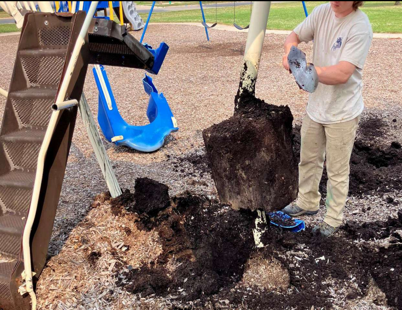
Lions Park Free Standing Slide removal