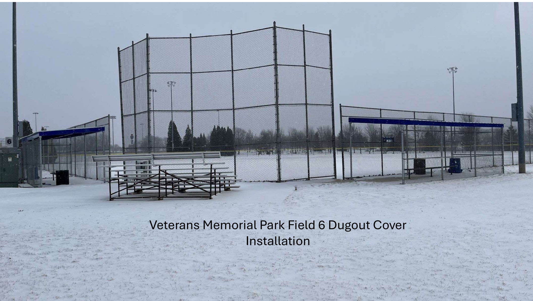
Veterans Memorial Park Field 6 Dugout Cover Installation