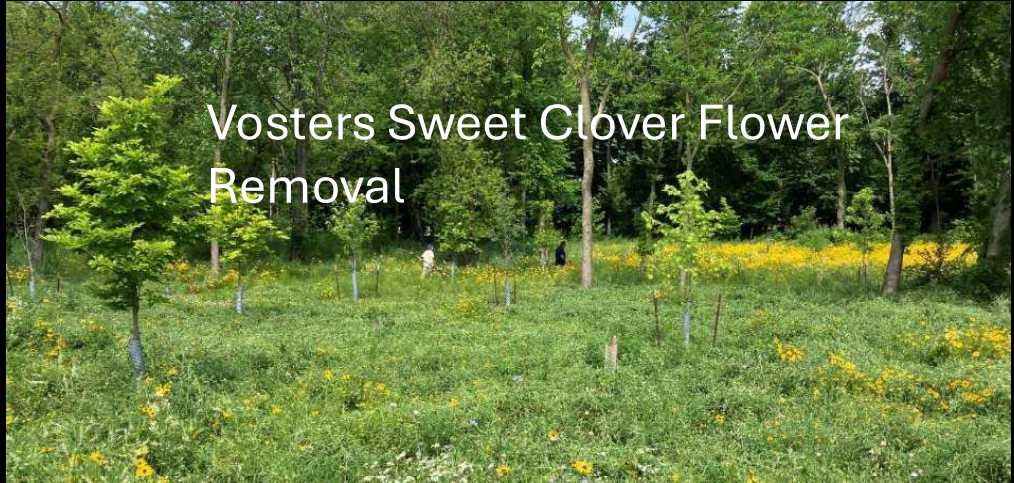
Vosters Sweet Clover Flower Removal