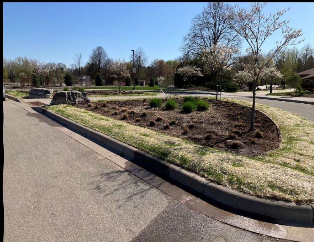
Scheig Entrance Beds