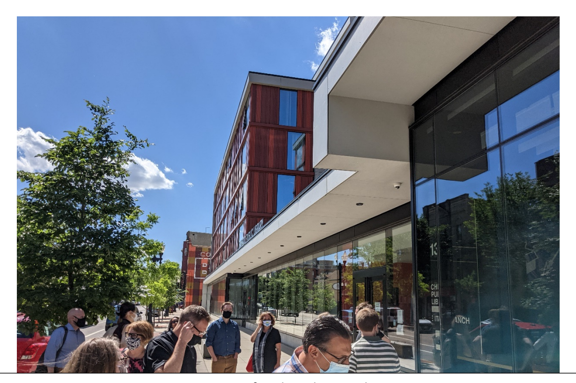
Exterior of Little Italy Branch