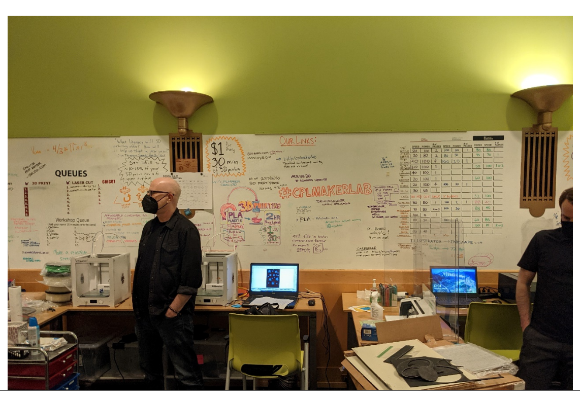
The Maker Lab at Harold Washington Library Center