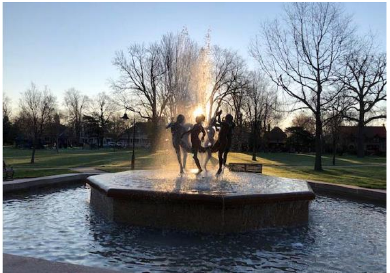
City Park fountain turned on in April