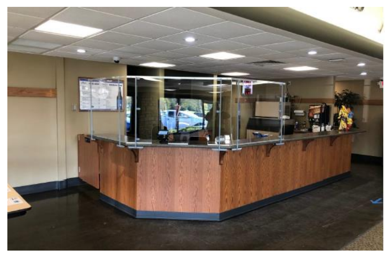
Social distancing barriers installed for Golf Course Clubhouse food and beverage service