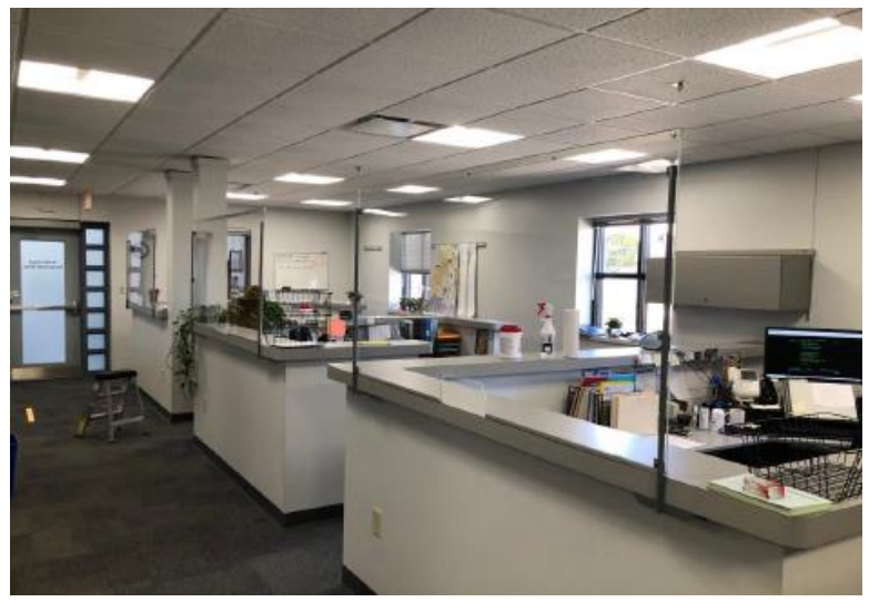
Social distancing barriers installed for MSB customer workstations.