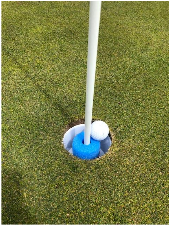
Pool noodles inside the cup to keep golfers from touching the flagstick, Reid no longer uses a pool noodle but has plastic covers which sit on top of the cup providing the same service but have a distinct sound that golfers were missing.