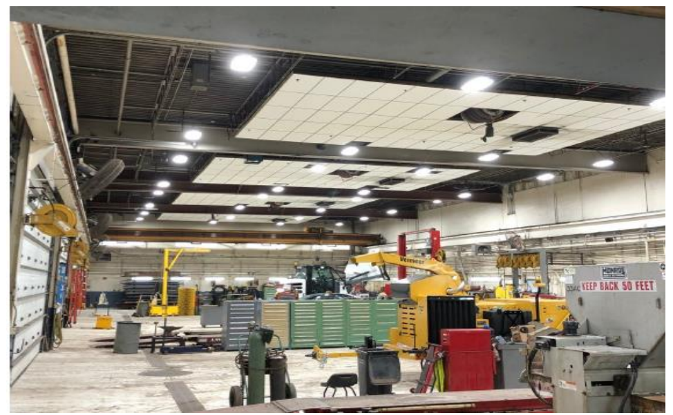
MSB CEA Mechanic Shop new LED fixtures installed