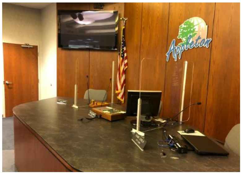
Social distancing barriers installed in the Council Chambers