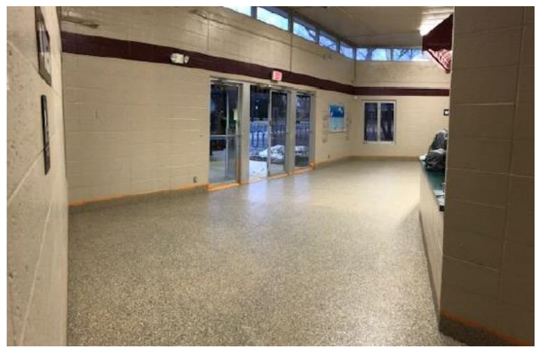
Mead Pool Bathhouse new epoxy flooring