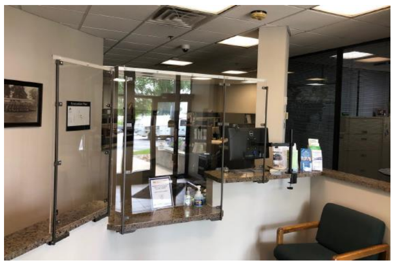
Social distancing barriers installed for Valley Transit