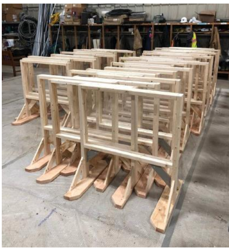
Voting barriers constructed for elections.

Staff constructed and installed social distancing barriers for employee workstations and customer service work stations at MSB, City Hall Council Chamber, Clerk's Office, DPW, Golf Course, Library, Transit Center, Valley Transit, and Police Station.