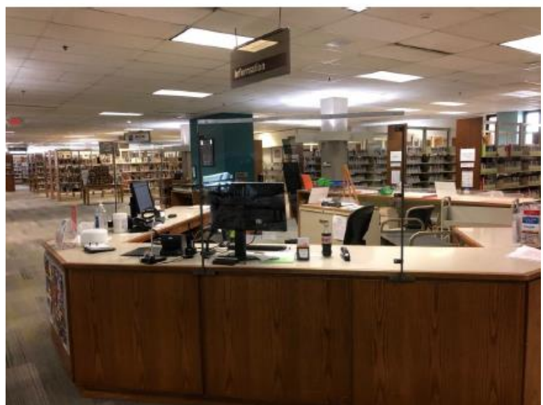
Social distancing barriers constructed and installed for Library service desks.