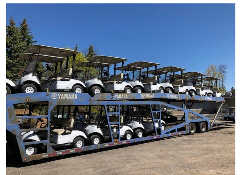
Taking delivery of new cart fleet, delivery was delayed as vendor's operations were shut down due to COVID-19.