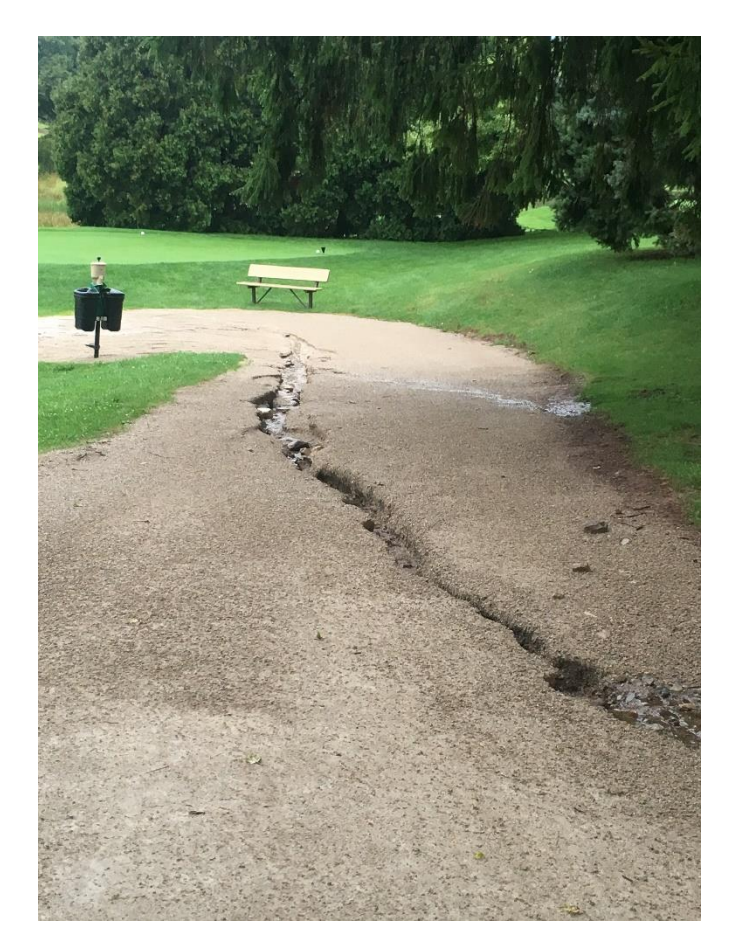
Cart path from #12 green leading to #13 tee washed out after a heavy rain.

For the fifth consecutive year Reid utilized extra help from AmeriCorps and the Summer of Service Program to assist on a few projects. A change in their schedule helped us maximize their time with us while maintaining the golf course on a day to day basis. The first two days they were at Reid they concentrated on mulching around the maintenance facility and landscape beds throughout the course which were not completed prior to their assistance. The second week we had severe bunker washouts and they helped staff clean out bunkers and get them back in playable condition and also helped clean up low branch pruning.