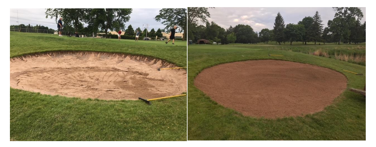
Bunker on #3 during cleanup and after raking.

Despite the poor weather the golf course held up well through the 2019 golf season, with no major disease outbreaks to report. Staff spent many days repairing bunkers and cart paths after heavy rains but that was expected with the unusual amount of heavy rains. Typically grounds goal is to have bunkers repaired within 48 hours of major rain events. The day after the event some bunkers are ready for cleanup and others get water pumped out so they are ready the following day for cleanup. Before the sand is put back in place silt must be removed, if not removed silt will clog the pore space of the bunker and not allow water to drain out of the bunker quickly. After two straight years of heavy rain sand additions will be necessary in 2020 to keep bunkers performing properly.