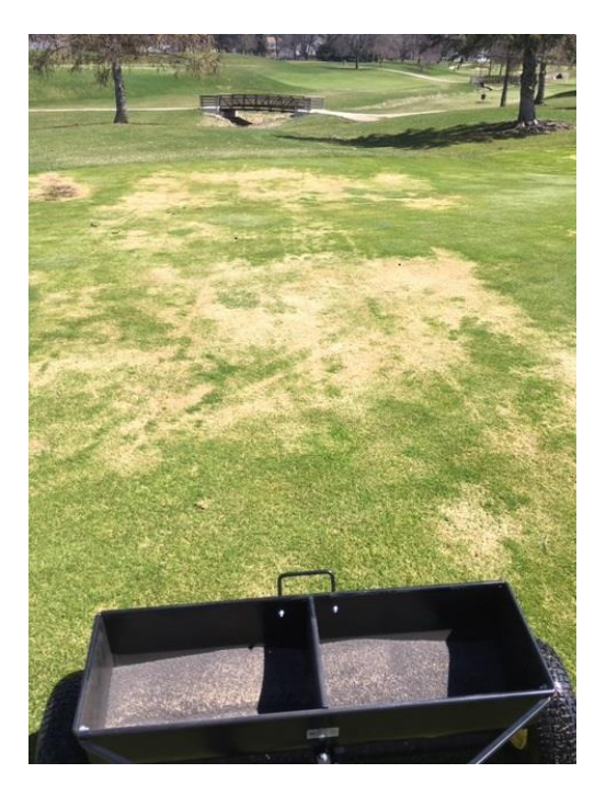
Seeding winter ice damage on #14 fairway in early May, if you notice the straight lines in damaged area those are from cross county skiing. Normally those marks would not be noticeable but the added turf stressed caused added damage.

Black sand getting applied to the large practice green, arrow points toward where sand has been applied.