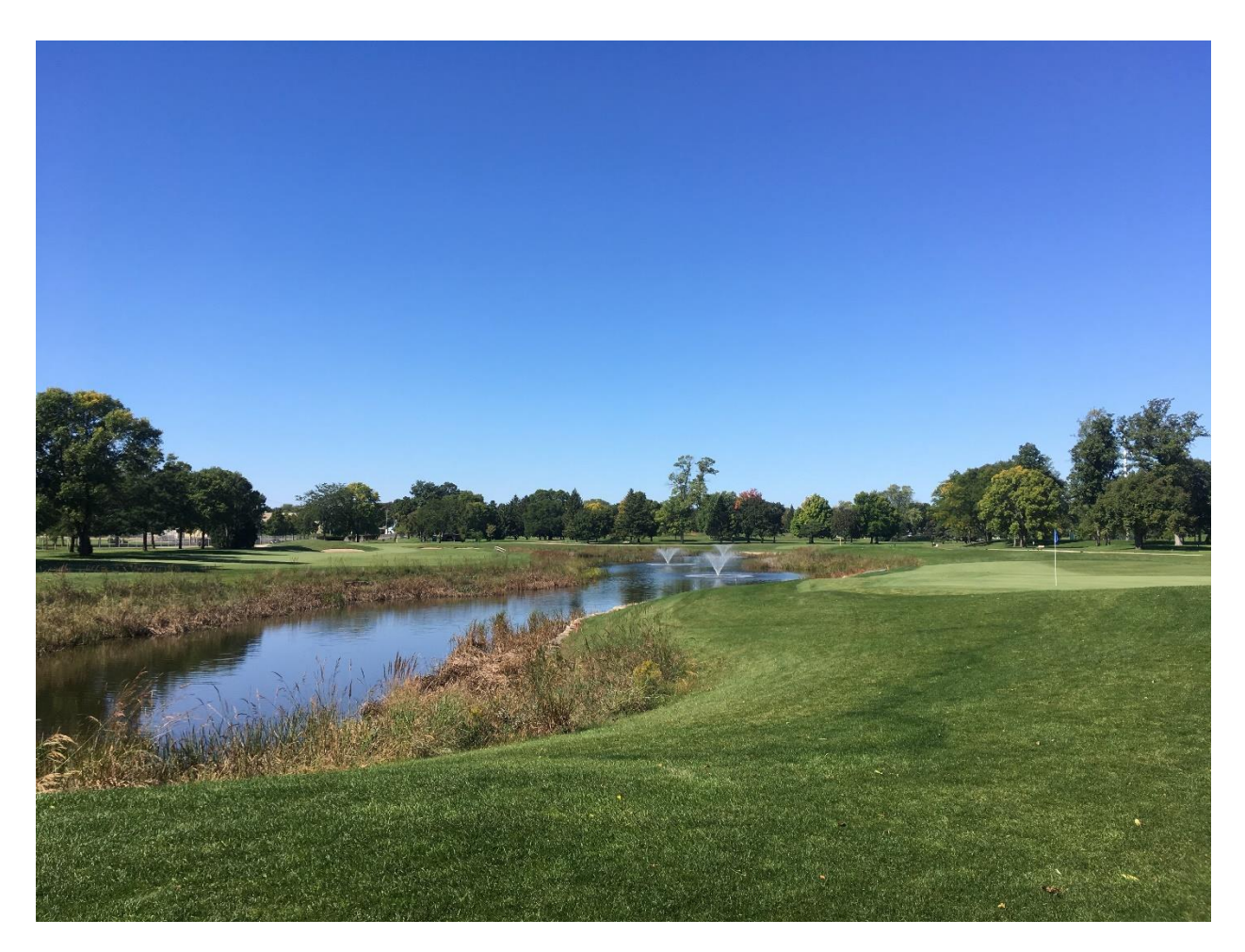
#2 & 3 on a perfect early fall day.