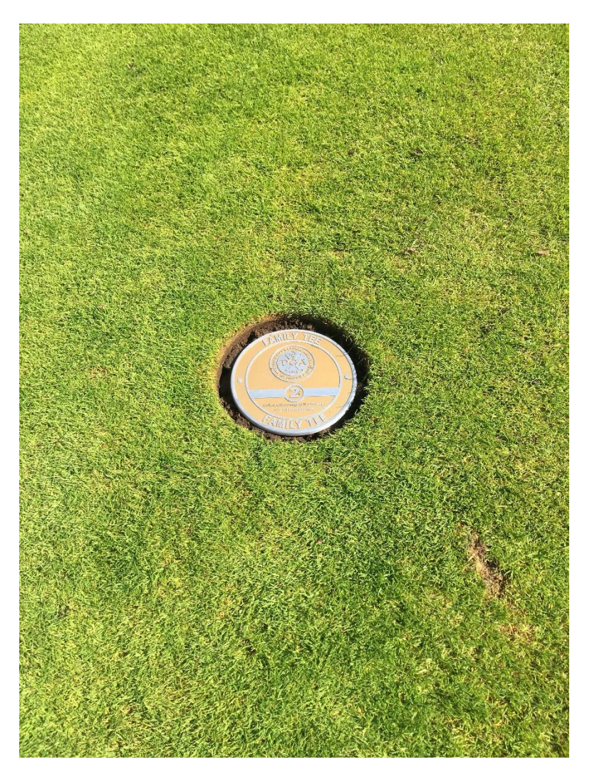
The front 9 has two sets of permanent junior markers, Gold markers play from 1791 yards and Blue play from 1385.

The ups and downs of 2019 were tough mentally, physically and financially at the golf course. Expenses were able to be held in check through the year from the same weather that wreaked havoc on revenues, saving on labor when possible and concession supplies. These cost saving measures allowed Reid to be profitable once again.