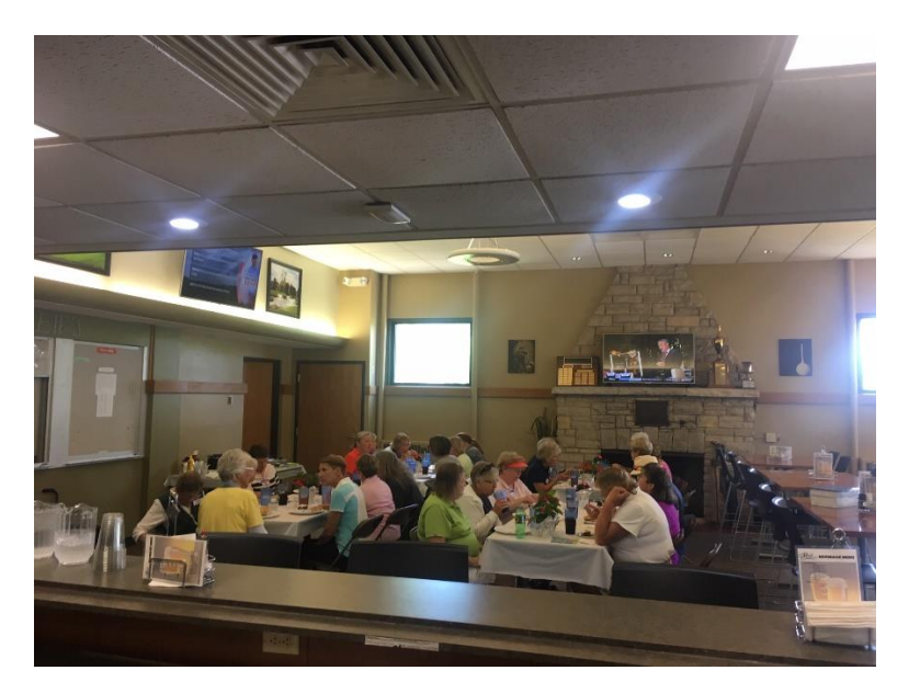
Ladies 9 Hole League mid-season Luncheon.