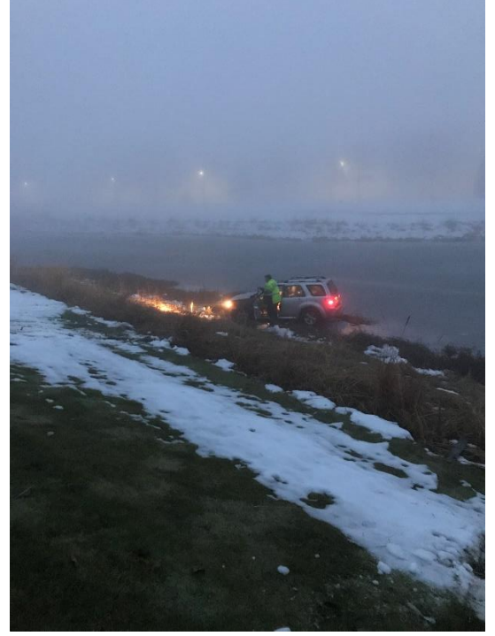
Assisting in car removal to not cause damage to the golf course.

major damage is expected to the turf (time will tell during spring green up) but fence repairs are necessary, this is the third vehicle incident in the past two year which are just some of the interesting events that make working on a golf course unique.