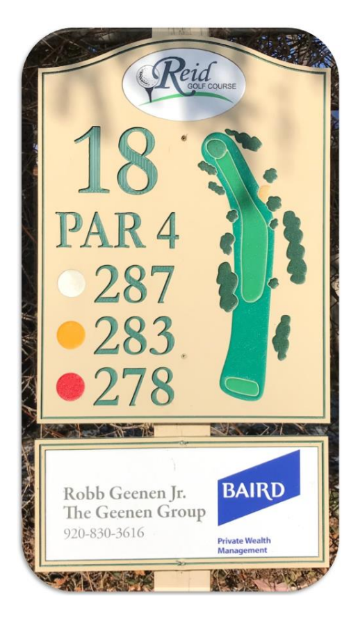
New sign advertising on #18 tee post.