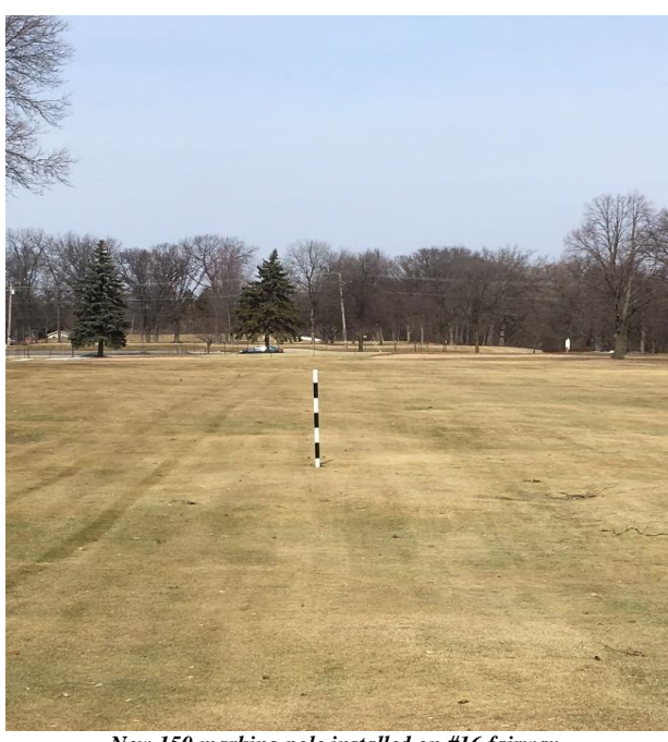
New 150 marking pole installed on #16 fairway.