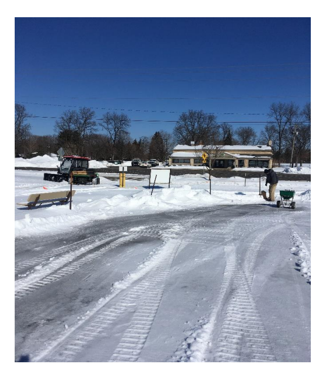
After removing snow black sand was added to absorb sunlight and melt the ice.