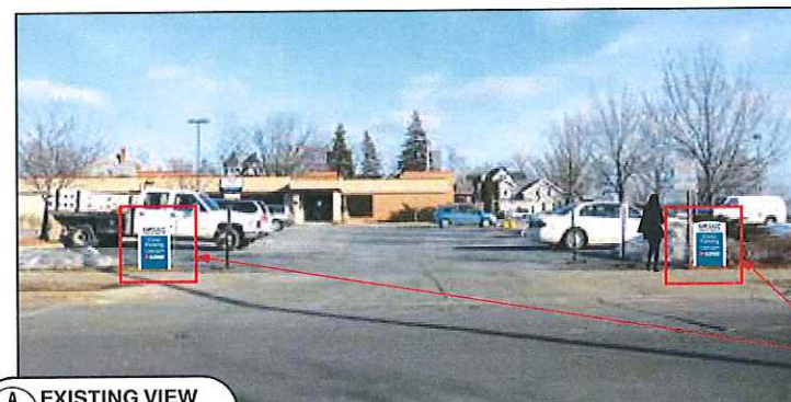
A EXISTING VIEW 2 N.T.S.