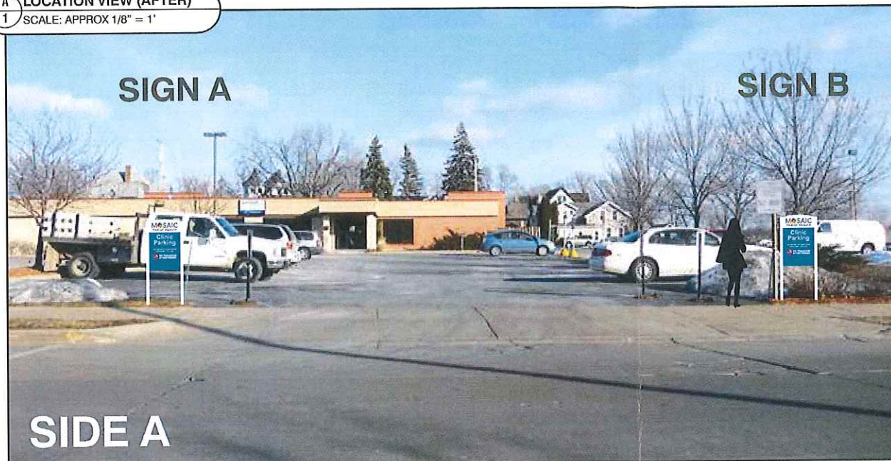
A LOCATION VIEW (AFTER) 1 SCALE: APPROX 1/8" = 1'