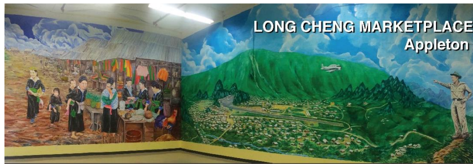
Figure 2 Long Cheng Marketplace, 1804 S. Lawe St., is a place for all businesses and vendors from restaurants, clothing retailers, beauty and small businesses.

A different set of programs may be needed to foster development of this group. The few programs targeting these entrepreneurs focus on helping them get additional work, providing business support services, and providing locations where they can conduct business functions, including amenities such as broadband access, meeting rooms, teleconferencing equipment, and general office equipment.