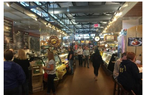
Figure 3 The concept of a Public Market was discussed during the planning process. Additional study is needed to determine feasibility.

Sites for retail development can be found within most of the City's commercial districts. In the case of established