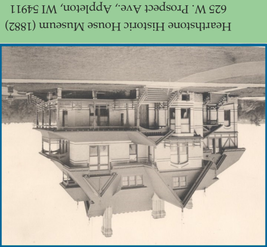
Heartstone Historic House Museum (1882) 625 W. Prospect Ave., Appleton, WI 54911

Approval from the HPC is required for any exterior alteration, construction, reconstruction, or demolition of a designated local historic structure or site or any property within a local designated historic district that requires a building permit. Ordinary exterior maintenance and repairs (i.e. painting, refinishing nonstructural elements) may be performed without HPC approval, provided a building permit is not required.