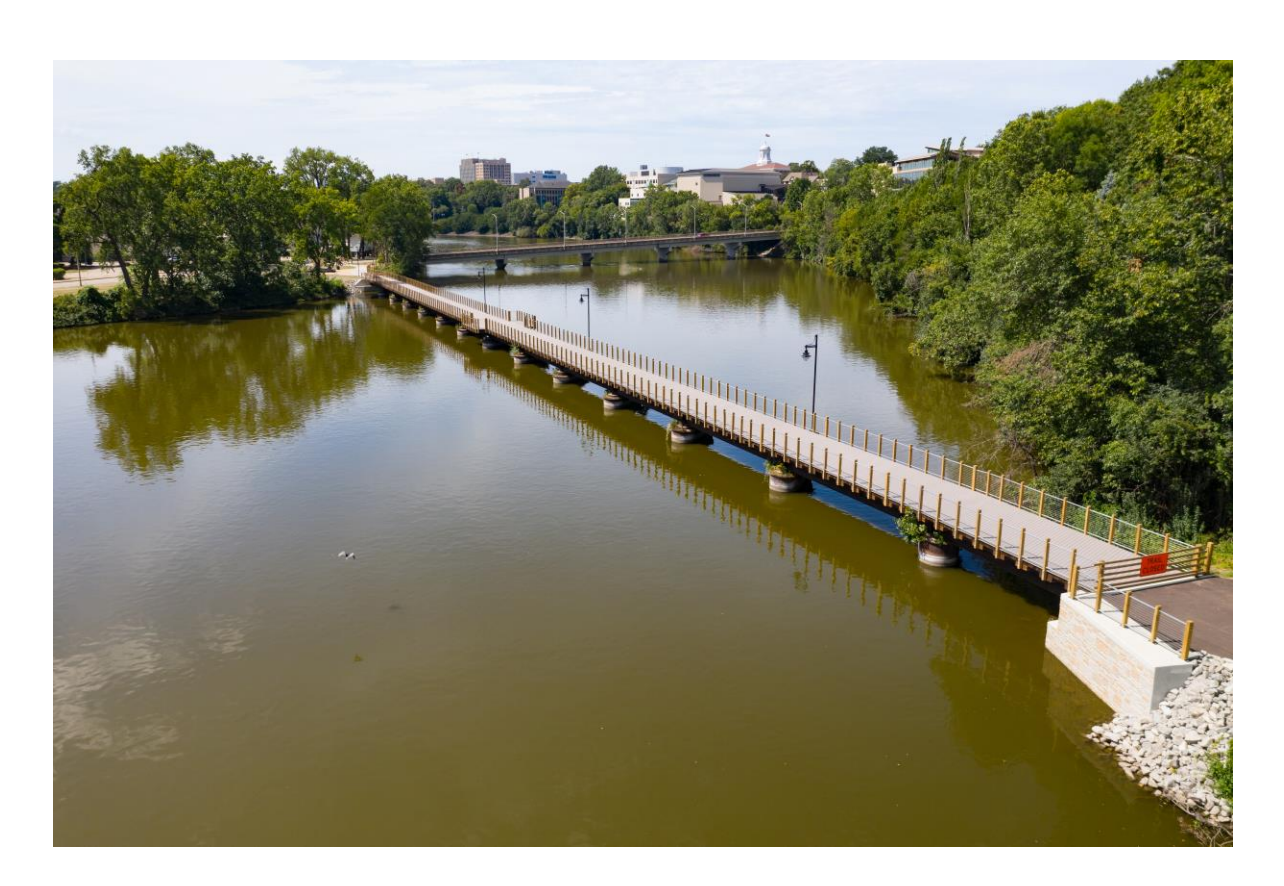
Lawe Street Trestle Conversion - 2020