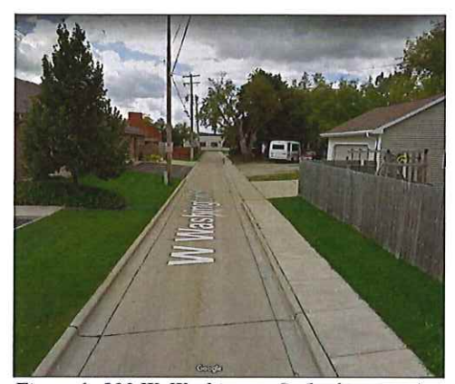
Figure 1-800 W. Washington St (looking west)

The block in question is a one-way (westbound) street that is extremely narrow, with very tight sight lines and no posted speed limit (see Figures 1 & 2 below). Despite the fact that this block looks, feels and functions like an alley, it is actually designated as a residential "street." As such, state statutes designate the statutory speed limit as 25 miles per hour (mph). State statues designate a 15 mph speed limit for designated alleys.