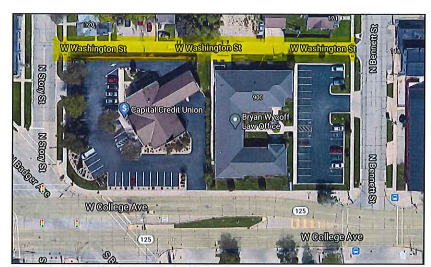
Figure 2-800 W. Washington St (highlighted)

Based on our review, the physical characteristics of this block are much more consistent with an alley than a typical residential street. As such, we recommend designating and posting a 15 mph speed limit for a 6-month trial period.