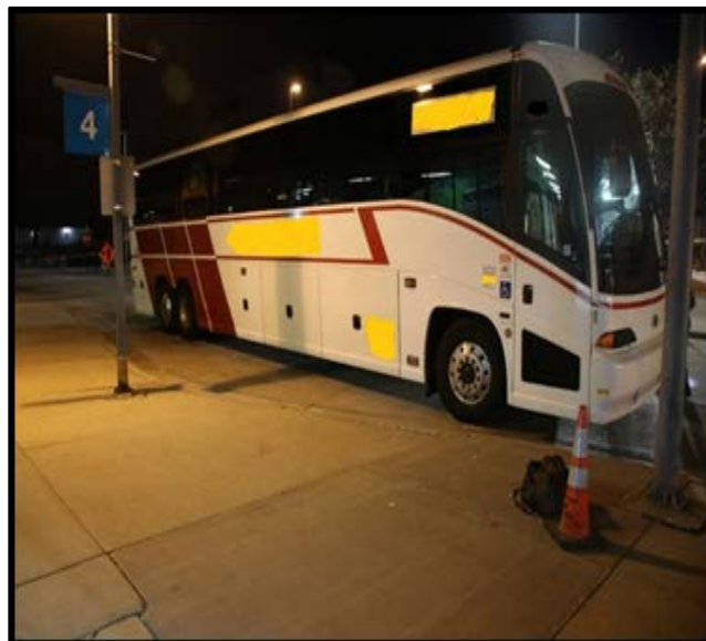
Photo 1. Incident scene. A career firefighter was killed, a police officer and a civilian were injured after being shot on an EMS incident after a patient who overdosed was revived and exited this bus.

On July 8, 2019, a NIOSH Medical Officer in the Hazard Evaluations and Technical Assistance Branch, Division of Field Studies and Engineering; a Senior Industrial Hygienist and Captain in the U.S. Public Health Service from the NIOSH Emergency Preparedness and Response Office; an Investigator/Safety and Occupational Health Specialist and an Investigator/Engineer with the NIOSH FFFIPP in the NIOSH Division of Safety Research traveled to Wisconsin to investigate this incident. The NIOSH investigators met with senior staff officers and representatives of the fire department. The NIOSH investigators met with and interviewed the career firefighters and fire department officers and the private EMS ambulance crew involved in the incident. The NIOSH investigators obtained and reviewed fire department training records, standard operating procedures (SOPs), incident scene photographs and drawings, training records, and medical records. The police officers who responded were not available to be interviewed. However, a redacted version of the official police report was provided from the neighboring police department that investigated the incident. The neighboring police department also provided redacted body camera footage for review by NIOSH investigators.