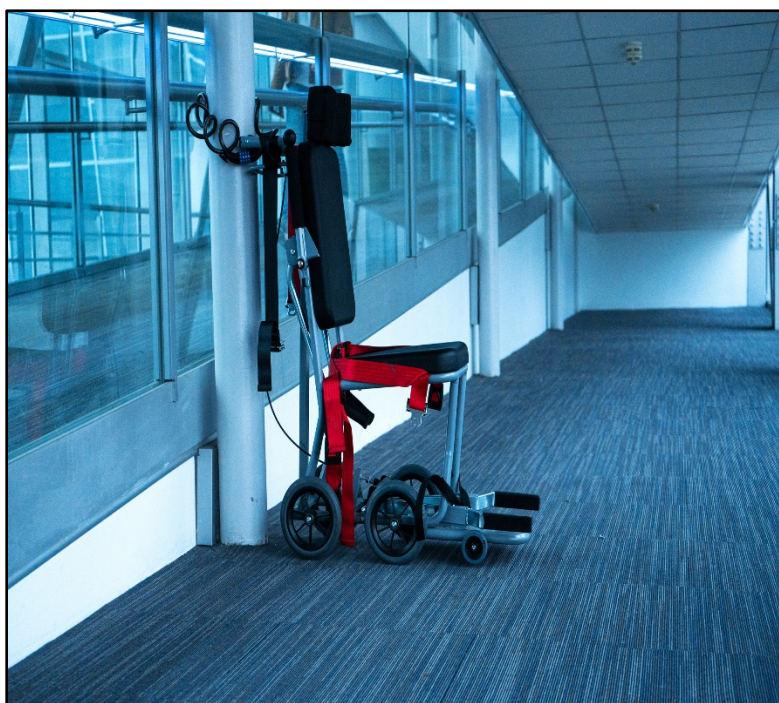
Photo 2. An example of a transfer chair ready for use in a transportation terminal.

In this incident, the patient was unconscious and sitting in a window seat on the bus. The patient was above average in size and weight and there were concerns about being able to move him safely off the bus. The patient was brought out of his unconscious state primarily so that he could ambulate off the bus. If a narrow space transfer chair had been available, either on the bus or at the transit station, it may have been able to be used in the narrow aisle. The wheelchair hydraulic lift on the bus may have been able to be used to get the patient off the bus, thus avoiding administration of the second dose of naloxone.