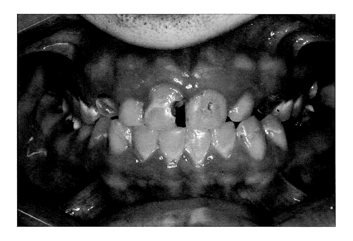
Figure 1: Effects of e-cigarette usage

By Scott Froum, DDS, and Alisa Neymark, DDS