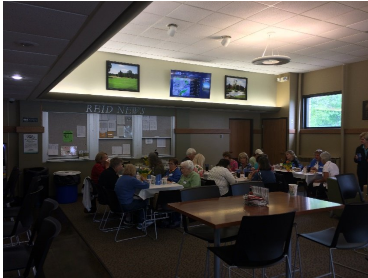
Ladies Flower League luncheon at the Clubhouse.