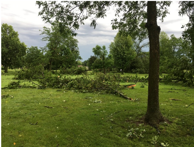
Looking East across #16 fairway to #15 tee after storm passed.