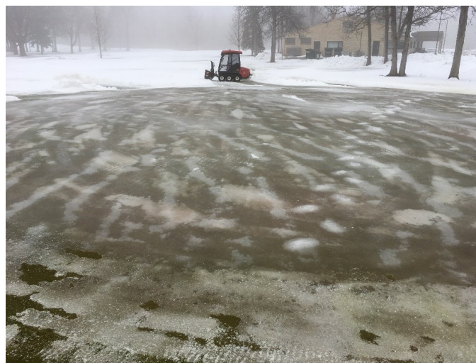
After snow removal 1/19.