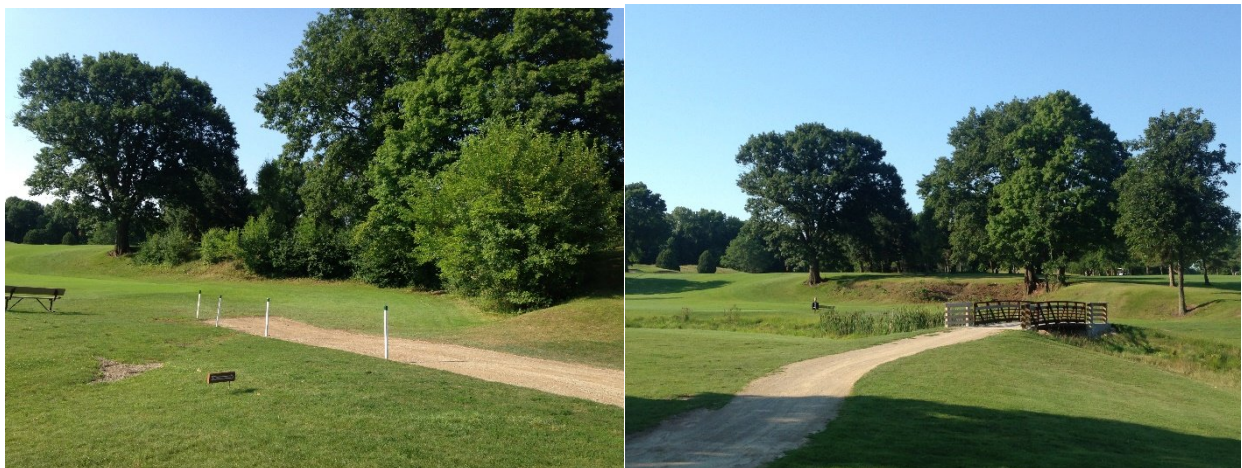
Before and after of scrub removal on #13 hillside after cart path extension.

A primary focus in 2016 was the management of the newer grass from the project and managing the turf differently to create the same playing conditions, primarily greens. The four newly constructed greens have a slightly different rootzone than the other 16 greens on property. The new greens are slightly firmer and putt slightly faster than the other greens, to combat this issue irrigation cycles were changed, mowing frequency differed, extra spiking and fertilization helped create more consistent conditions in 2016. As the greens mature they will become more and more similar to the others.