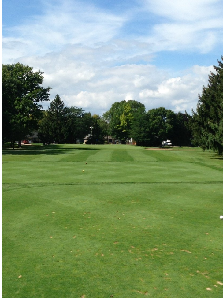
#4 on a late summer day.