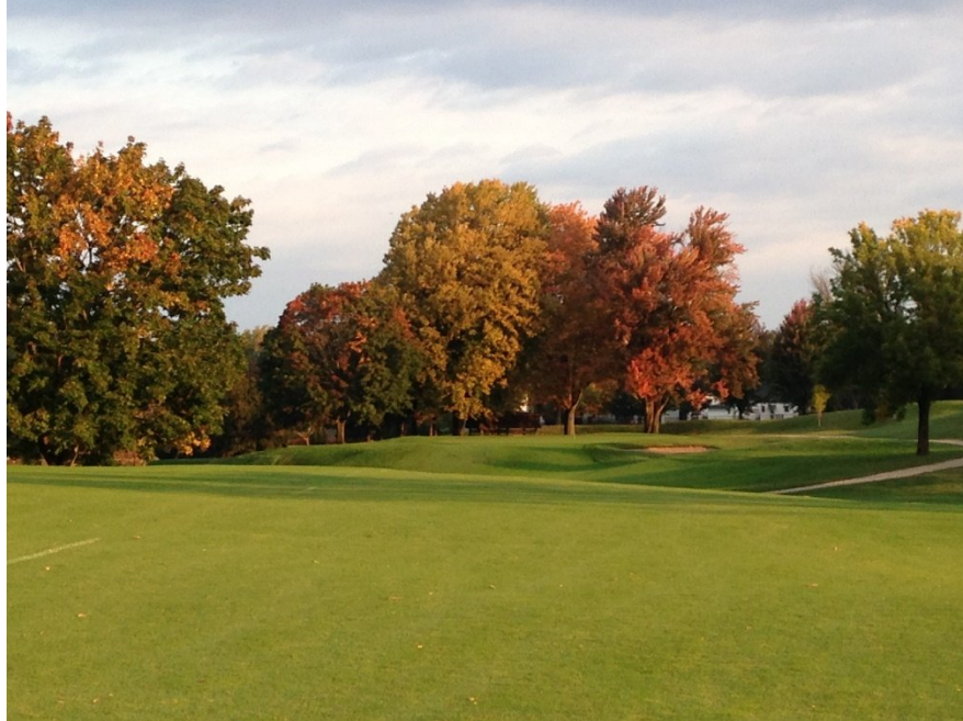
#12 Green surround showing great fall color.

Moving forward Reid is looking to hire fewer employees who work more hours; this will help with POS, customer recognition and overall accountability of the employees. Overall the staffing in 2016 was improved and the staff was quite dedicated. Retaining a good portion of our staff from 2016 will make 2017 smoother and more efficient because they know the process and customers.