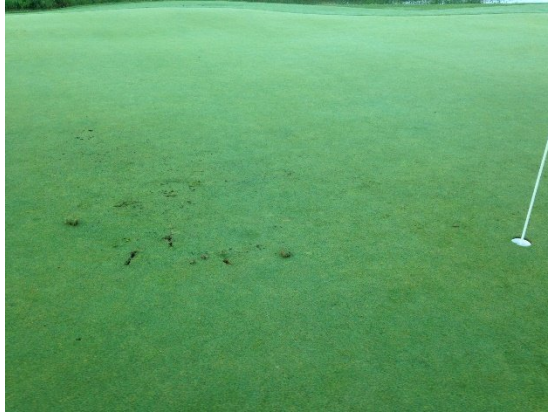
Damage to #2 green from stone being thrown/dropped on putting surface.

One last notable project of 2016 was the transplant of two trees. With the impending construction project at Erb Park & Pool, Reid took advantage of two newly planted trees and had them transplanted to Reid. These two trees were placed in a location to replace current trees which are in decline.