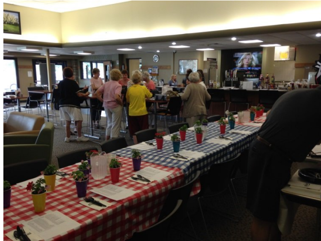
Ladies 9 Hole League mid-season Luncheon.

During tournaments, outings and events Reid was able to setup a buffet lunch for the guests. Space is limited and can only accommodate 99 customers but it is another service the golf course offers.