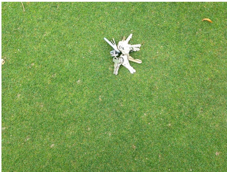
Finished product of greens aerification after the equipment breakdown.

The great fall weather presented great revenue opportunities for the golf course; aerification which is necessary to relieve compaction and improve gas oxygen exchange was done very late this year in an effort for golfers to enjoy the superb playing conditions. This is a very labor intensive project with every grounds employee working on aerification for two straight days while greens are finished. The front 9 and back 9 were closed on consecutive days to accommodate the work and this worked out well. Long working days during greens aerification create the playing conditions that golfers want to enjoy. Normally staff removes a core from the green but halfway through the 2 nd green a mechanical breakdown slowed and changed operations. At this point a quick decision was made to use solid tines for aeration instead. This change is still beneficial with the relieving of compaction and gas oxygen exchange but it does not remove thatch. Luckily, numerous years of pulling cores has left the thatch layer very manageable in our greens. Other than a few select tee boxes where the turf becomes puffy the rest of the golf course was solid tined with very minimal disruption to play.