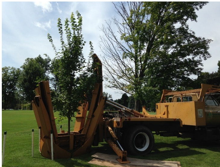
Tree getting planted on #18, Maple in background in decline.

One last notable project of 2016 was the transplant of two trees. With the impending construction project at Erb Park & Pool, Reid took advantage of two newly planted trees and had them transplanted to Reid. These two trees were placed in a location to replace current trees which are in decline.