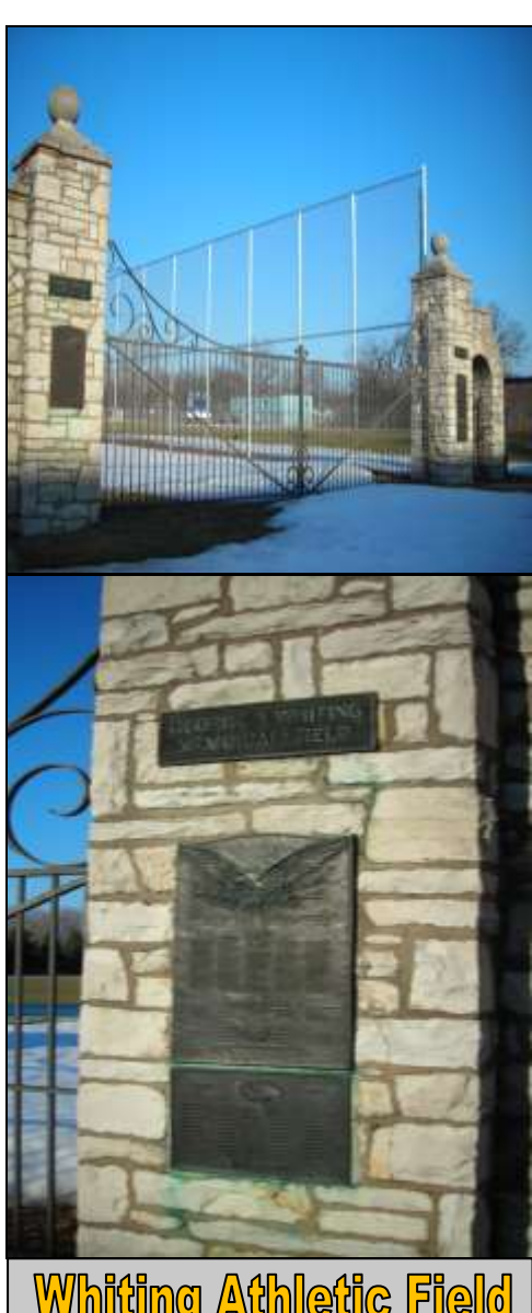
Whiting Athletic Field

Appleton Historic Preservation Commission Bookmark Series "Memorials"