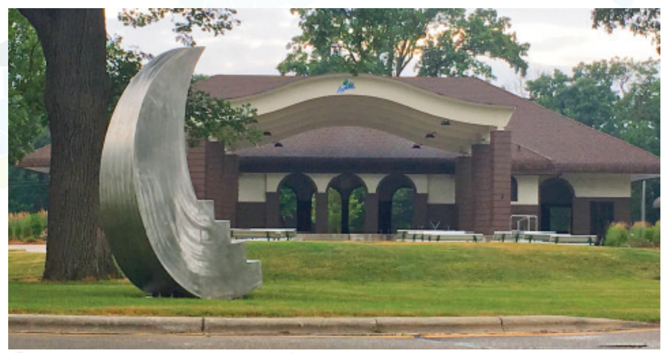
Stairway to the Stars current aspect in Pierce Park