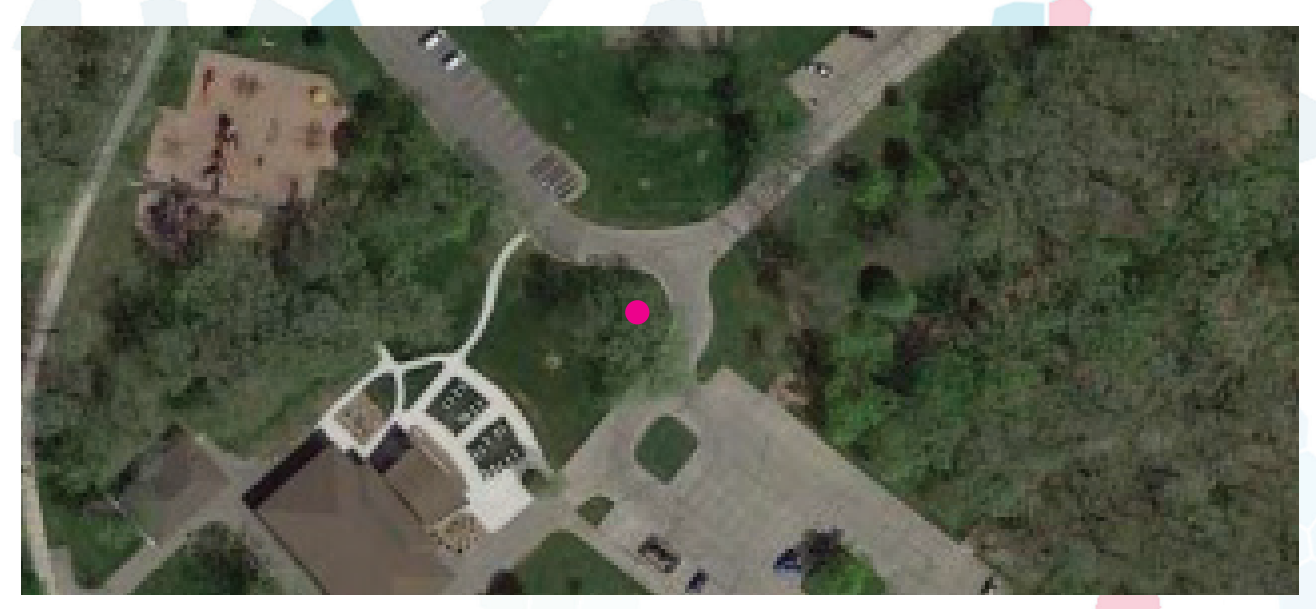
Location of Stairway to the Stars in Pierce Park