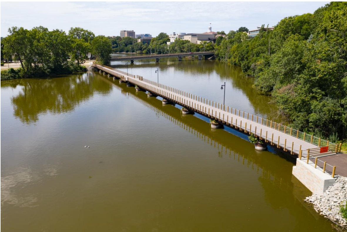
Lawe Street Trestle Conversion - 2020