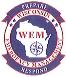
EXHIBIT C Wisconsin Hazardous Materials Response System