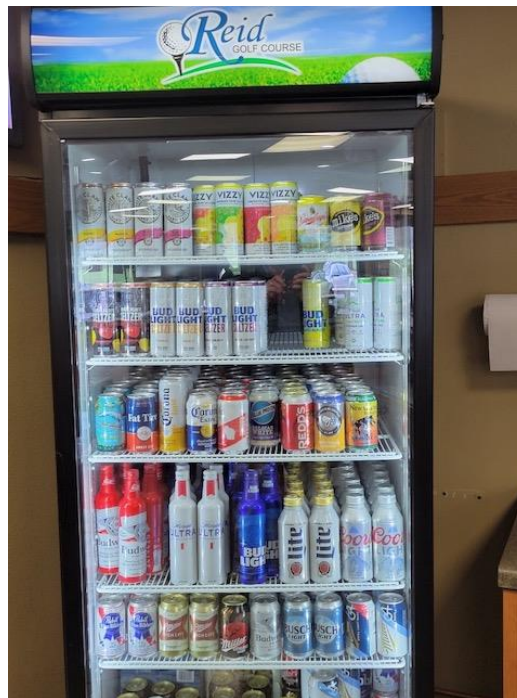
New cooler stocked for another busy day.