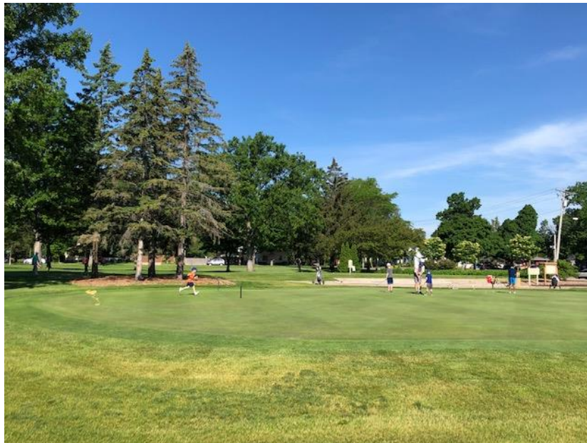
First week of junior lessons, practicing putting.