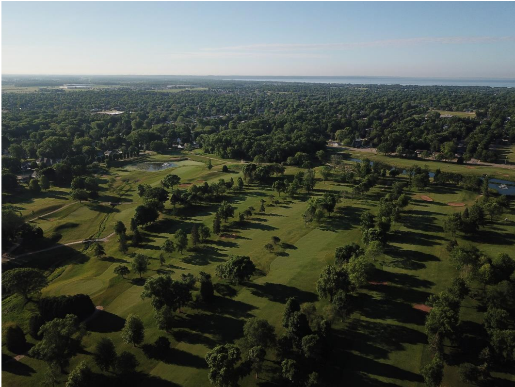
Photo taken above #1 tee towards the southeast corner of the property.