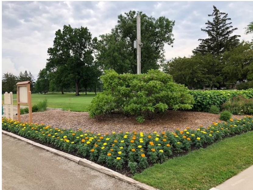
Marigolds planted at #1 tee