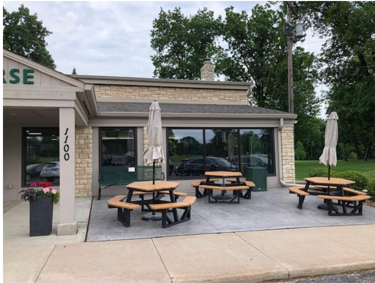
New paved patio with tables setup.