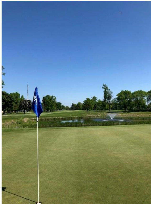
#3 green looking towards #8 on another gorgeous afternoon for golf. Left of pin cell tower with panels removed.