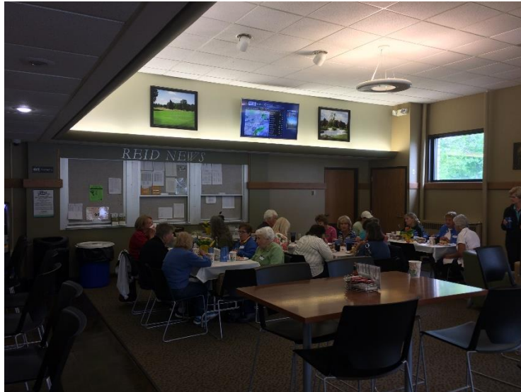
Ladies Flower League luncheon at the Clubhouse.