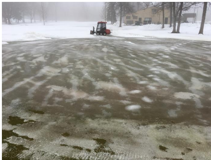
After snow removal 1/19.