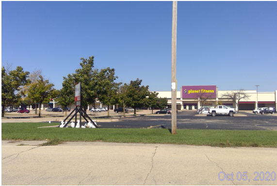
Property Detail for 31-7-0044-00