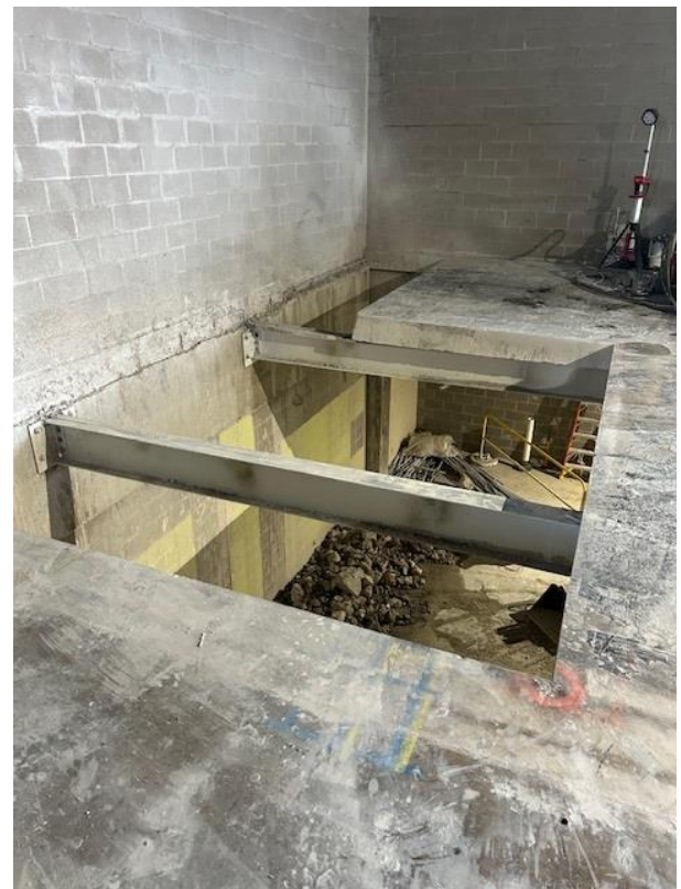
Freight Elevator – Upper Level