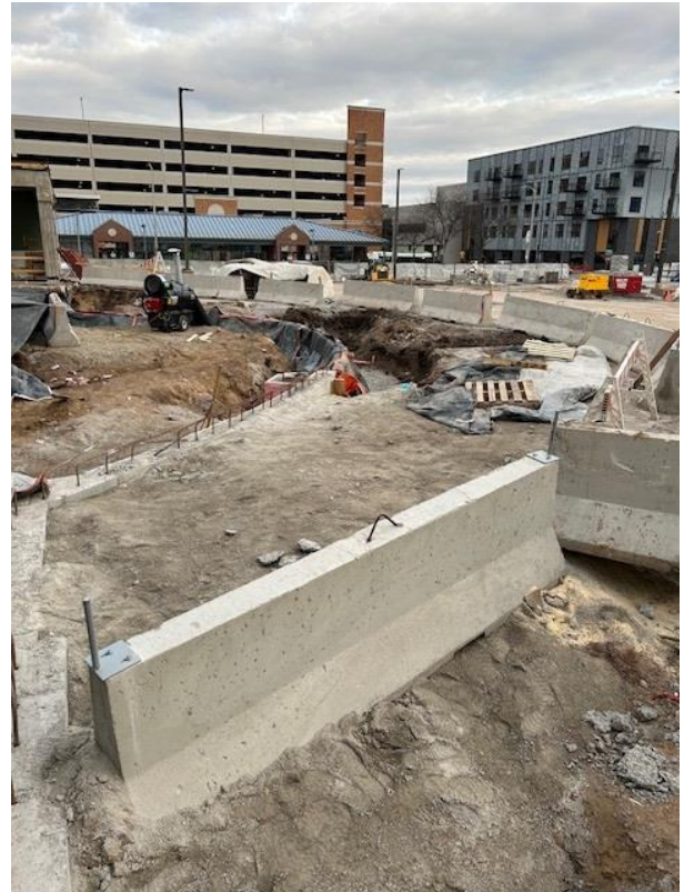
Foundation Wall at Pavilion