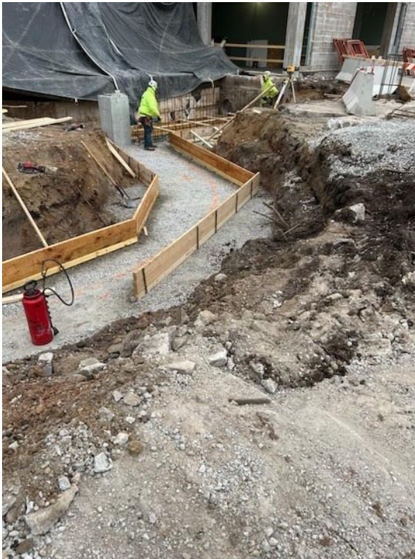
Footing at Pavilion Foundation Wall