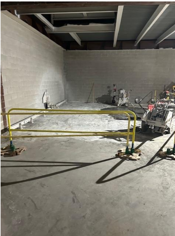
Freight Elevator – Upper Level