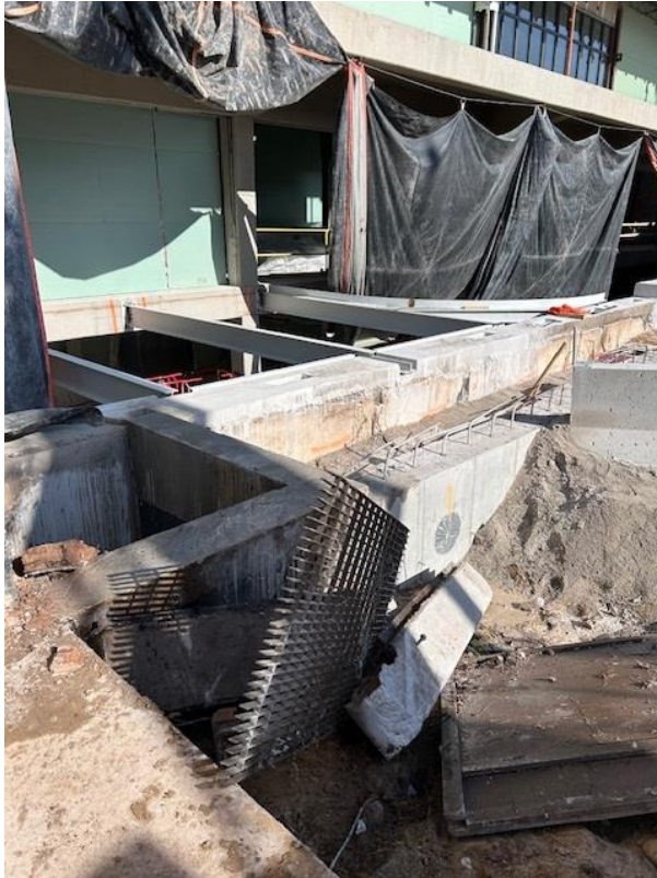
Ground Level Flooring Steel