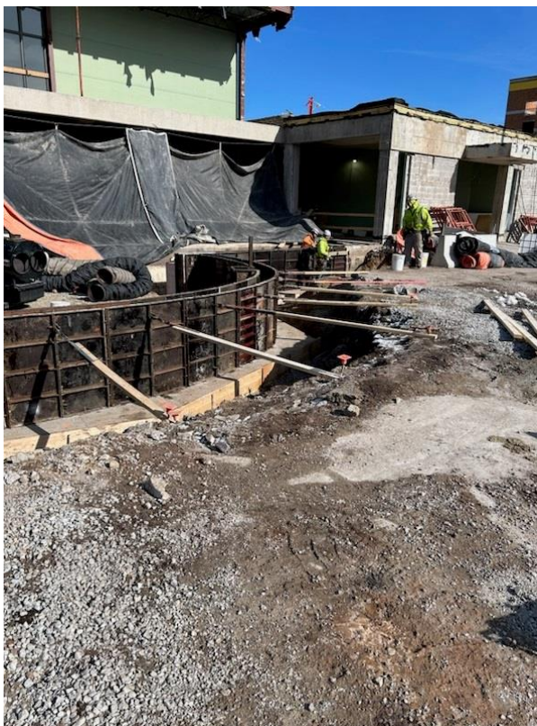
Foundation Wall at Pavilion