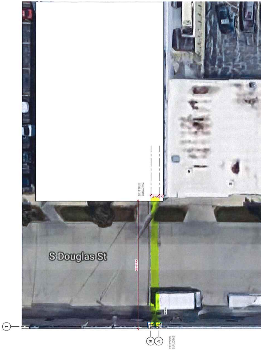
1 PIPE BRIDGE LOCATION PLAN SCALE 1/8" = 12'