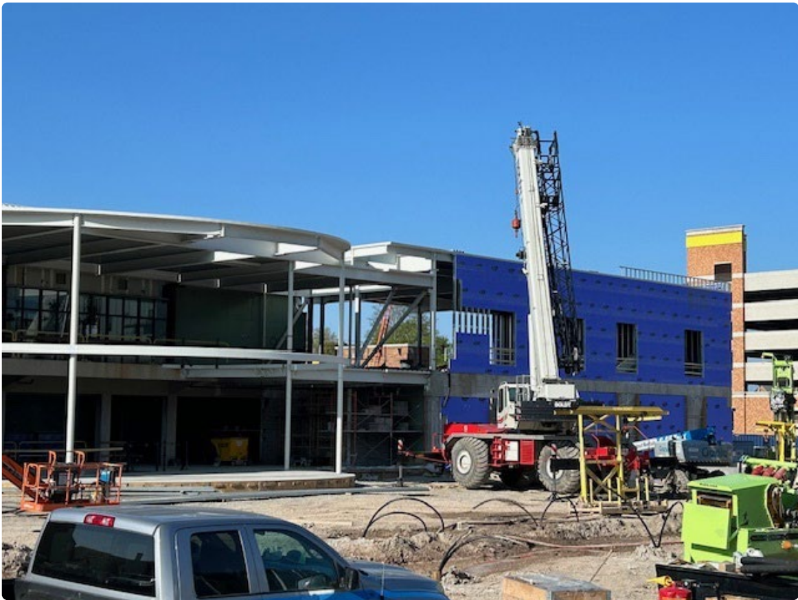
South Elevation - The Commons & Meeting Rooms