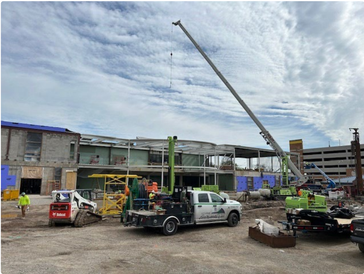
South Elevation - The Commons & Meeting Rooms