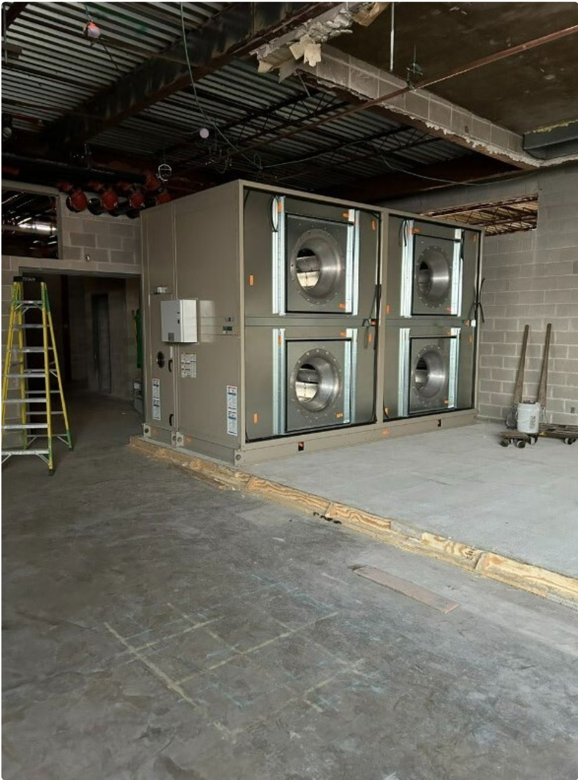
Air Handling Unit in Mechanical Room