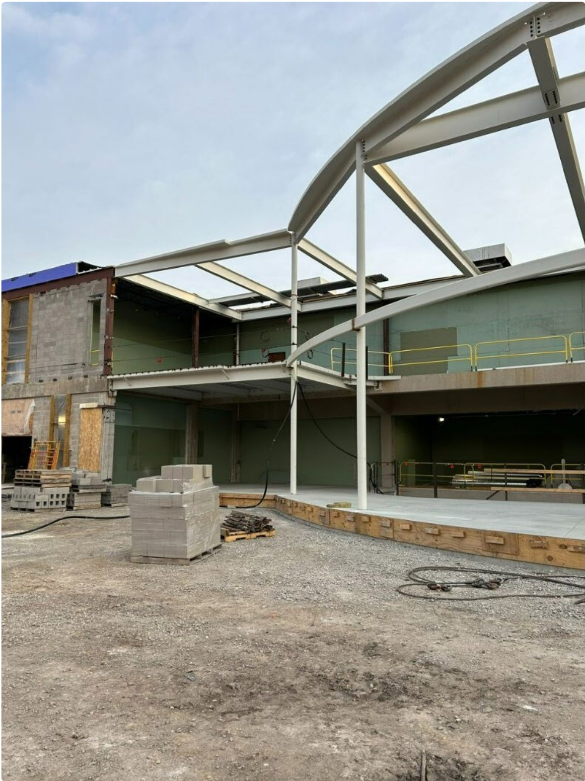
South Elevation - Framing The Commons