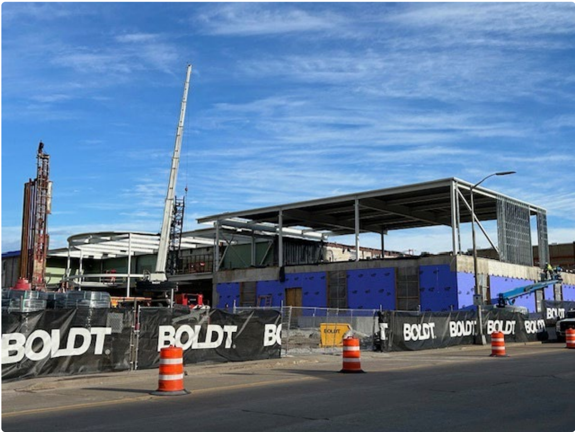
South Elevation - Meeting Rooms & Staff Break Room