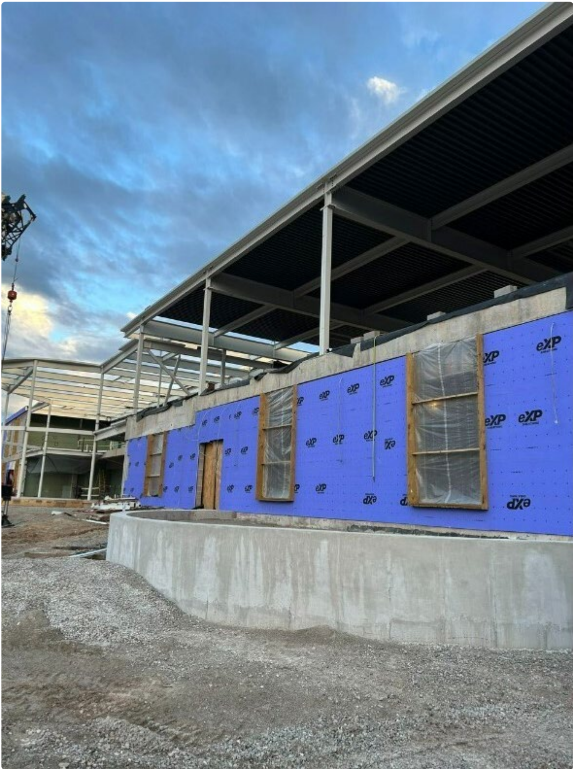
South Elevation - Meeting Rooms & Staff Break Room