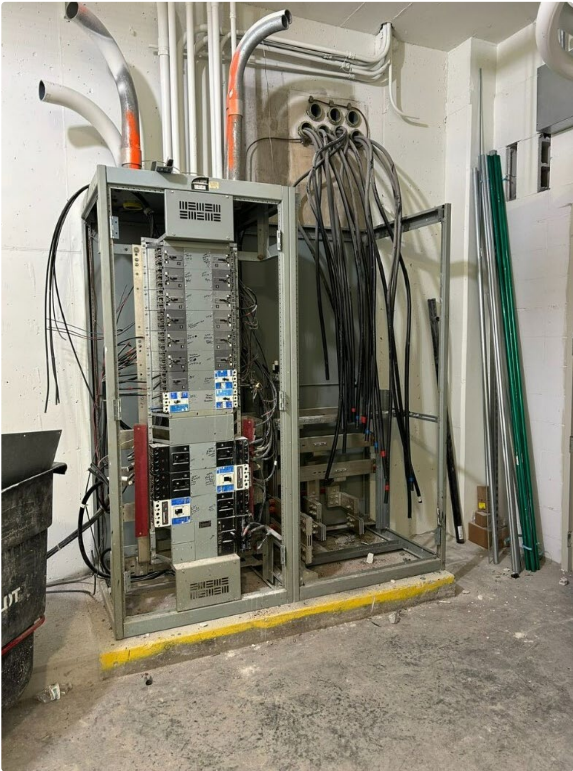
Demolition of Old Switch Gear