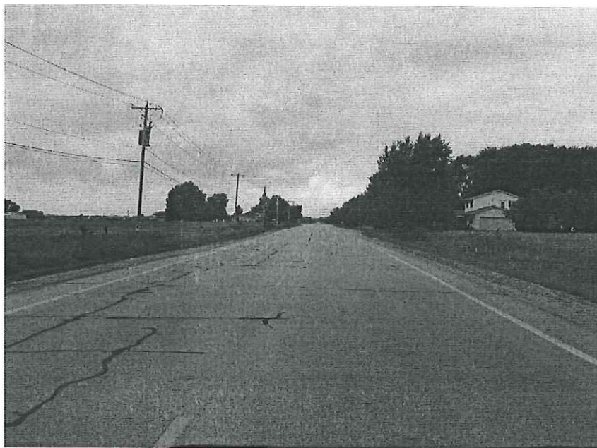
CTH JJ Facing West Near Holland Road Existing Speed Limit = 55 mph