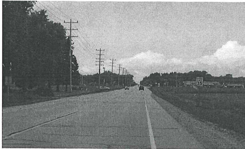
CTH JJ Facing West Looking at Lightning Dr Existing Speed Limit = 35 mph

Existing conditions can best be understood through the following site photos: