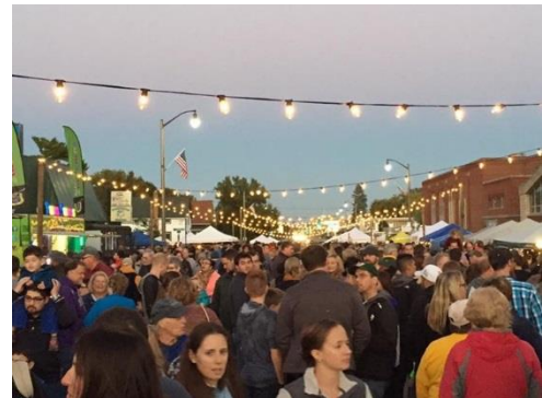
Figure 2 In 2016, Pulse Young Professionals Network organized the Fox Cities first night market.

People in these occupations are drawn to a handful of places. The presence of major research facilities is one factor in determining where these places will be, but other considerations include quality of life amenities that may include natural features or offer a vibrant urban lifestyle. The City of Madison is one Wisconsin community often cited as a magnet for the creative class, but the U.S. Department of Agriculture’s Economic Research Service has prepared county-level data that show several other Wisconsin places as leading creative class destinations. The following table contains data on county rankings among all of the