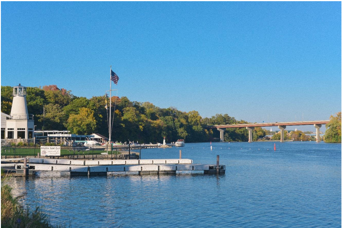
Figure 1 The Fox River continues to be a strong asset for economic development within the City.