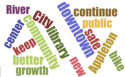
Figure 4 The word cloud summarizes responses to the survey question: What are your hopes for the future of Appleton?

The project team conducted two focus group meetings with key arts and culture, sustainability and historic preservation community leaders. The purpose of these discussions was to better understand opportunities and constraints to investment in the study area from the unique perspectives of these individuals and organizations.