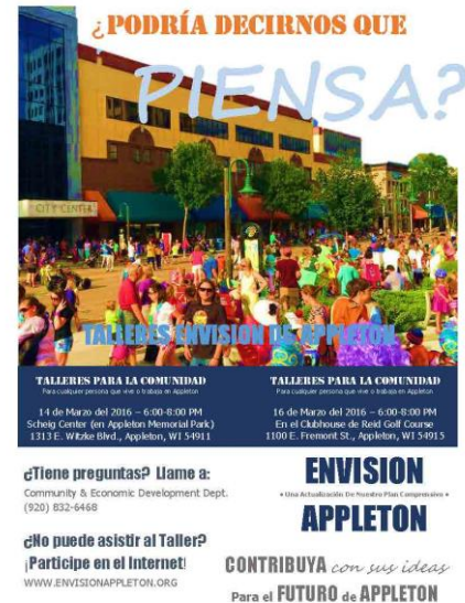
Figure 2 March 2016 Issues & Opportunities Workshop Poster (Spanish version)

Using an interactive website, the project team provided opportunities for 24-7 public input. The website was also used to communicate project status, post draft work products, and solicit input on alternatives. Participants were able to leave place-specific comments by clicking on an aerial map of the City.