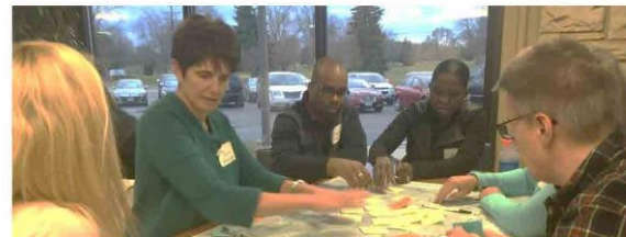
Figure 5 The "Meeting in a Box" provided a self facilitated opportunity for people to contribute to the planning process