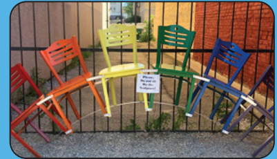
DOWNTOWN CREATES: ARTFUL CHAIRS