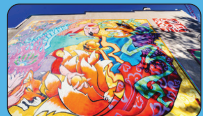
TASTE OF THAI MURAL