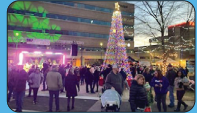
LIGHT UP APPLETON