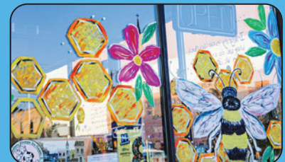
DOWNTOWN CREATES: PAINT OUT