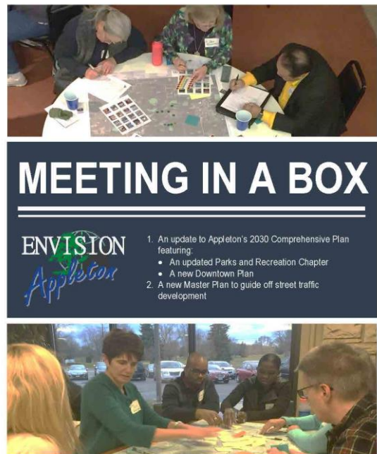
Figure 5 The "Meeting in a Box" provided a self facilitated opportunity for people to contribute to the planning process

The CPSC oversaw the project and met monthly (10 times). While the CPSC's purview included updating multiple elements of the City's Comprehensive Plan, the committee discussed the Downtown Plan element at two of its meetings.