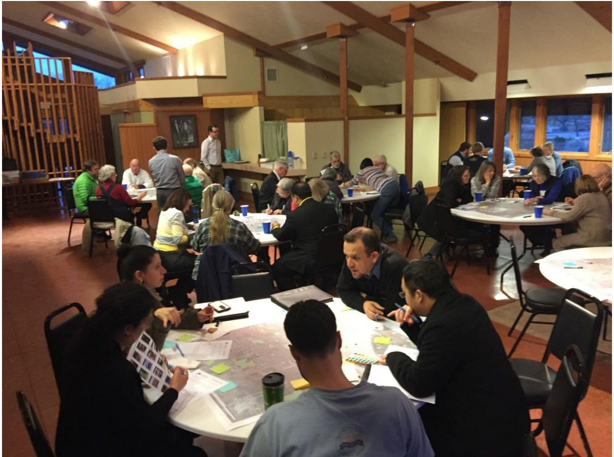
Figure 1 March 14, 2016 Issues & Opportunities Workshop