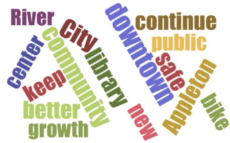
Figure 4 The word cloud summarizes responses to the survey question: What are your hopes for the future of Appleton?

The project team conducted two focus group meetings with key arts and culture, sustainability and historic preservation community leaders. The purpose of these discussions was to better understand opportunities and constraints to investment in the study area from the unique perspectives of these individuals and organizations.