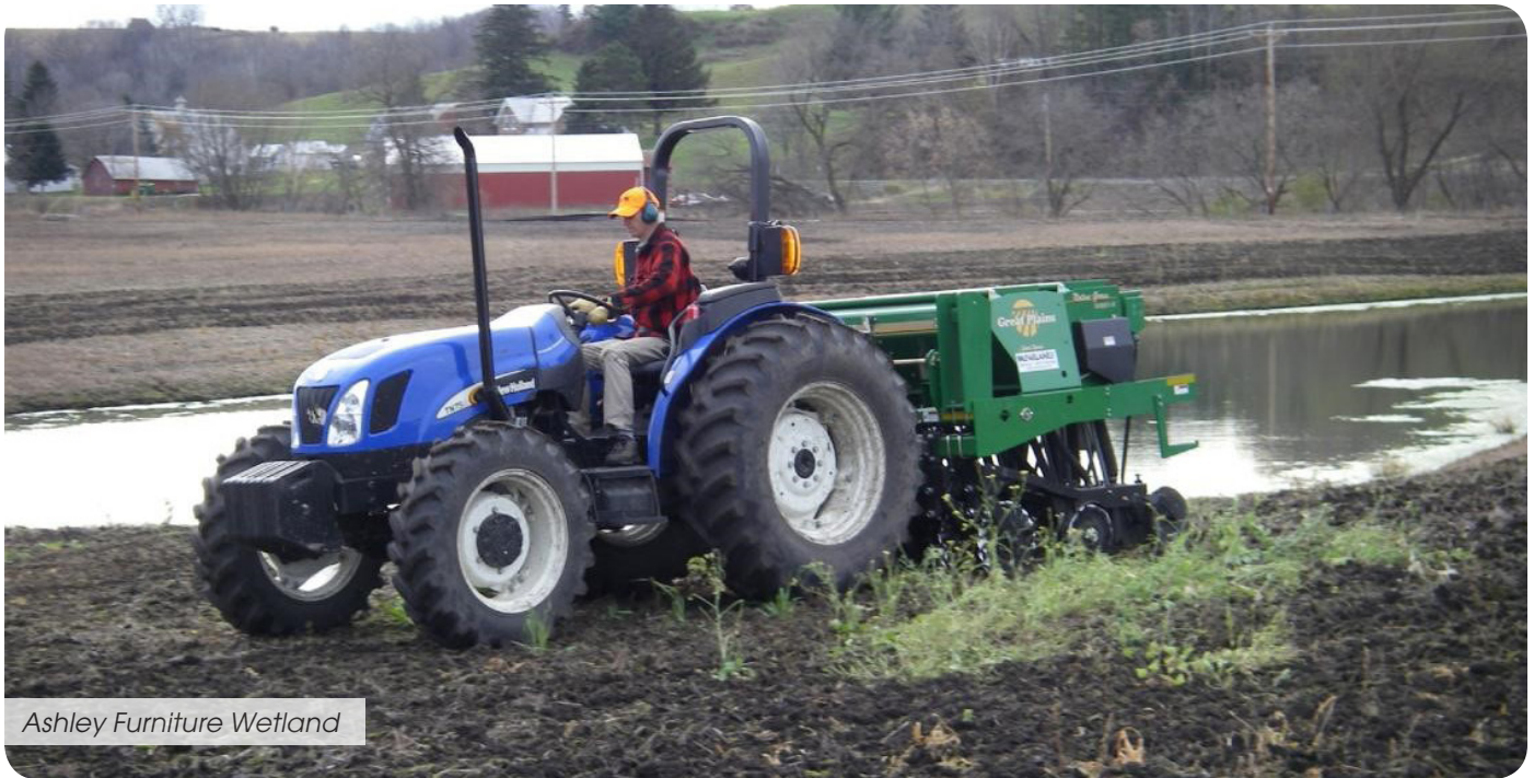
Ashley Furniture Wetland