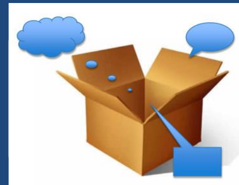
Meeting in a Box