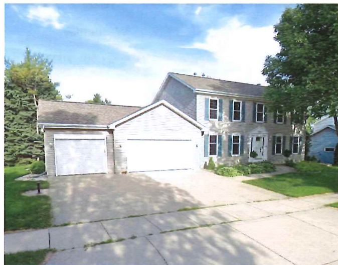
COMPARABLE NO. 2

Address 1 Tilbury Ct Parcel Number 31-6-4112-00