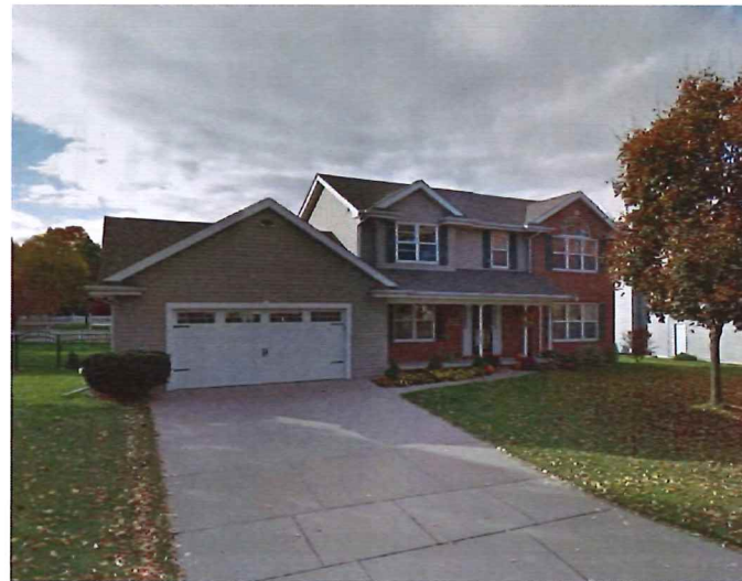
COMPARABLE NO. 1

Address 1 Tilbury Ct Parcel Number 31-6-4112-00