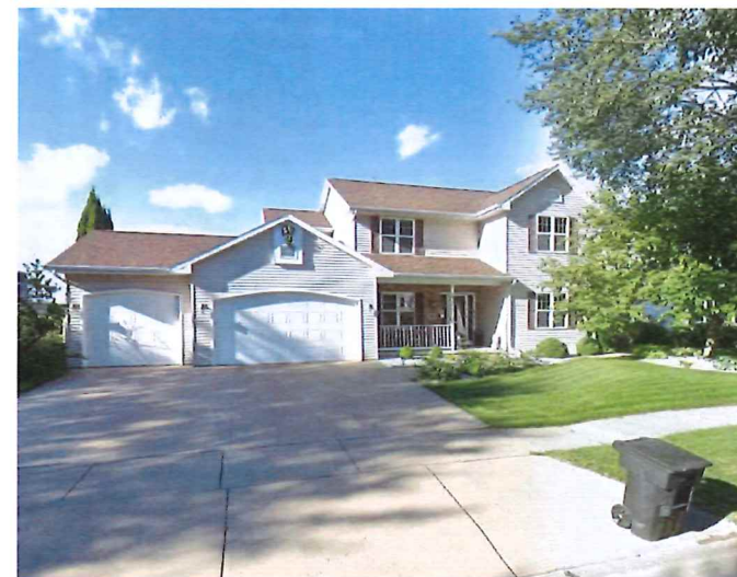
COMPARABLE NO. 3

Address 4208 N Woodridge Dr Parcel Number 31-6-5273-00