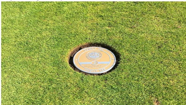
Junior marker installed.