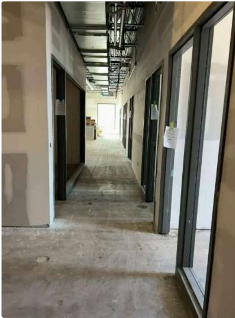
Upper-level staff offices and work area