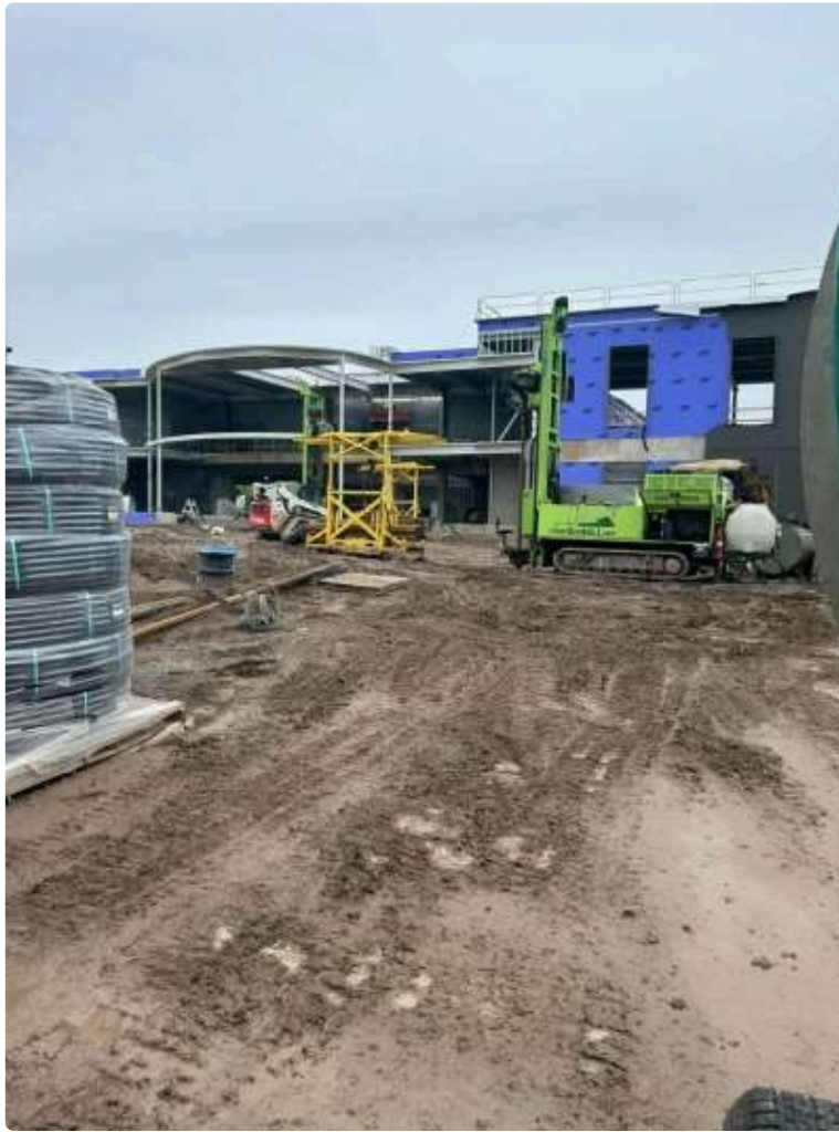
South side of building with common area and geothermal drilling