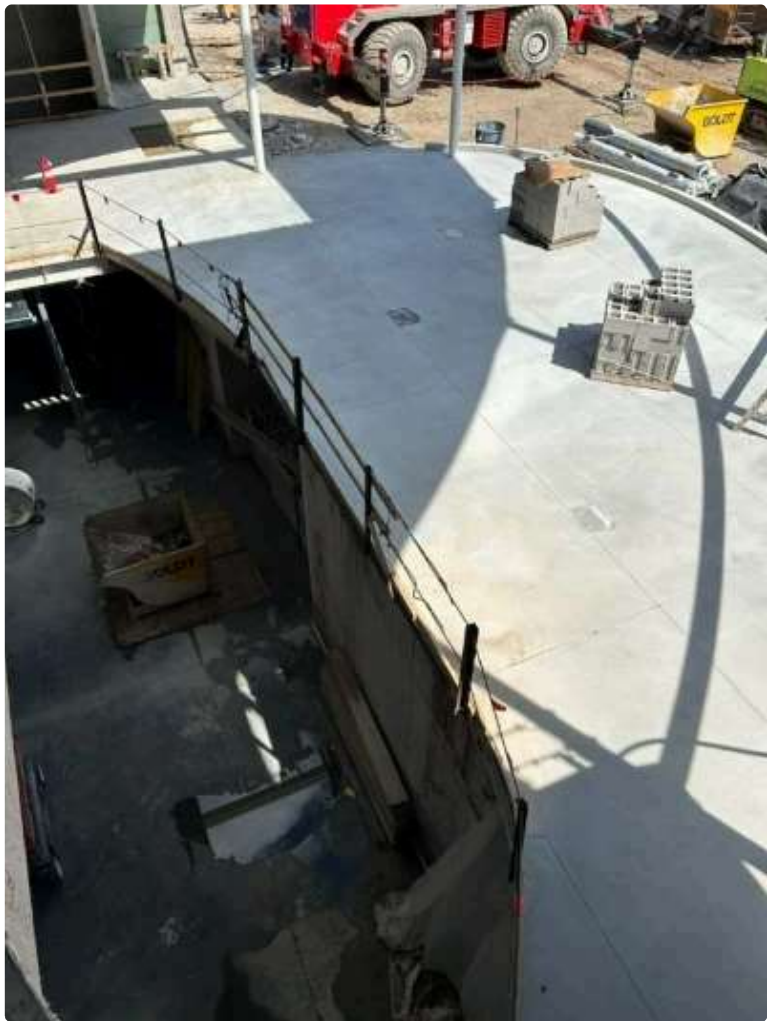
View of commons area from upper level