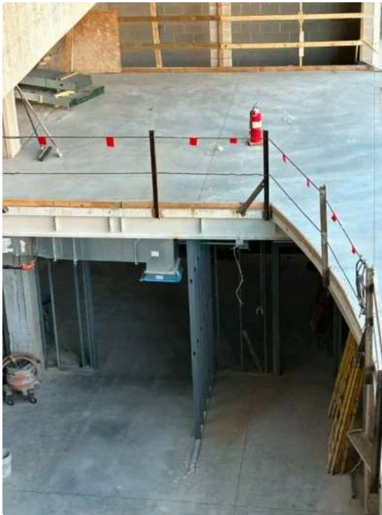
Learning stair view from upper level