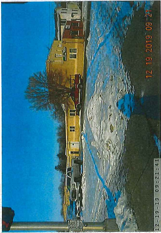
#21 115 N. Mason - Before