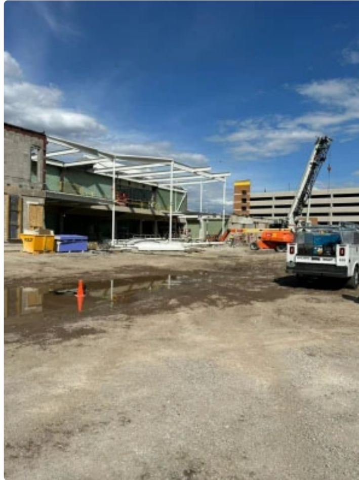
Front exterior steel installation - "The Commons"