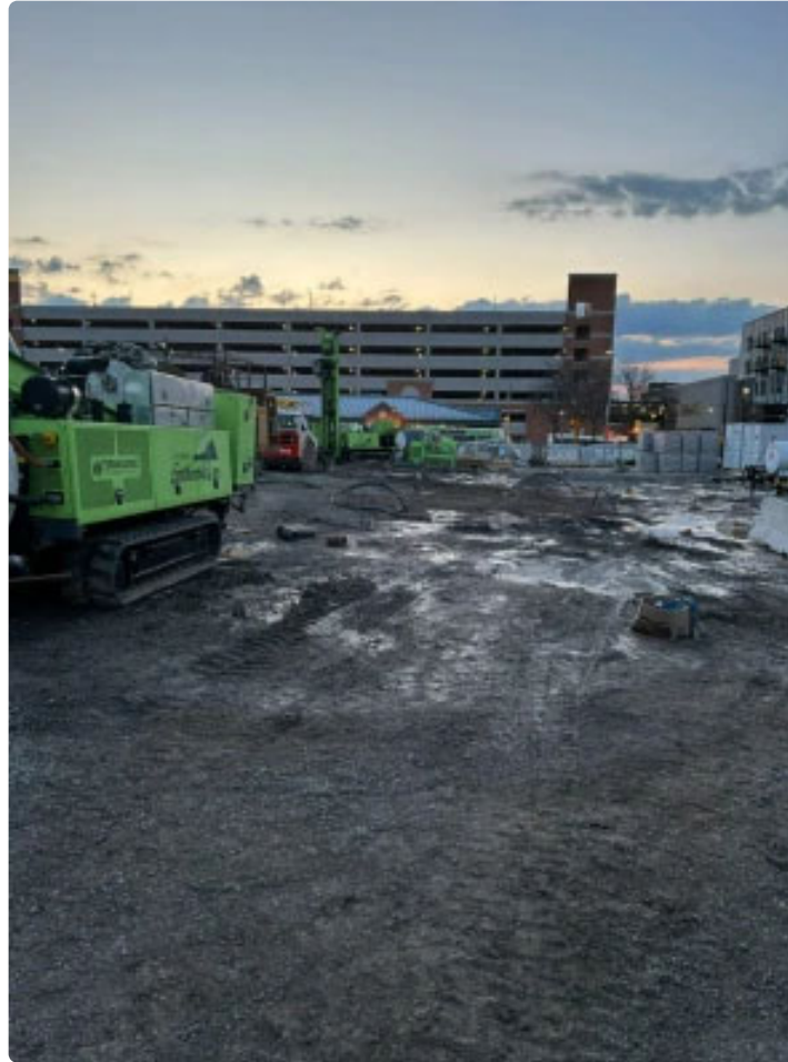
Geothermal well drilling