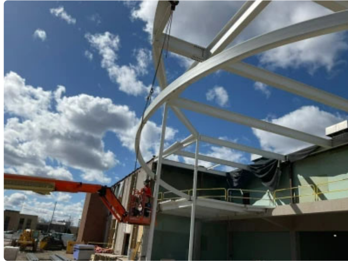
Front exterior steel installation - "The Commons"