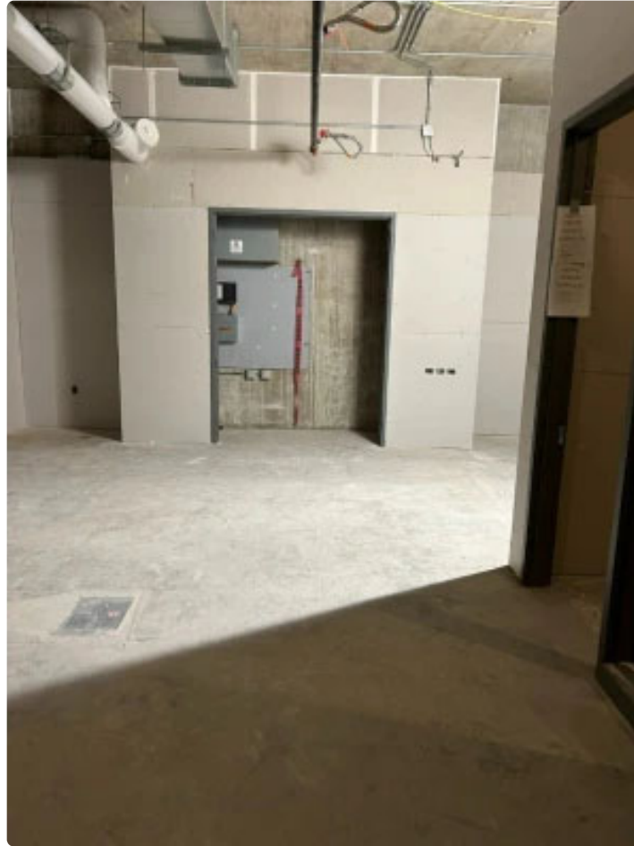
Fiber optic closet at lower level