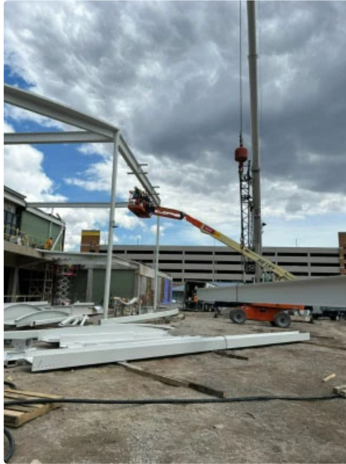
Front exterior steel installation - "The Commons"