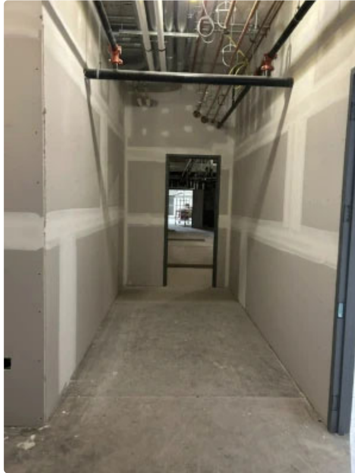
Corridor to mechanical, electrical and plumbing room at lower level