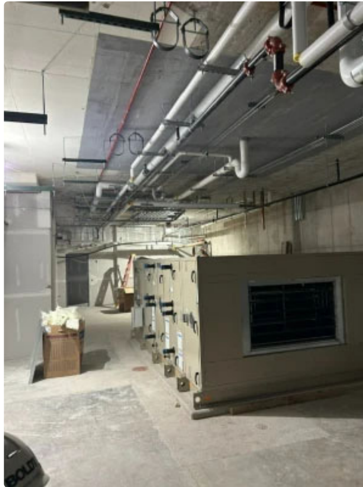
Air handling units in mechanical room at lower level