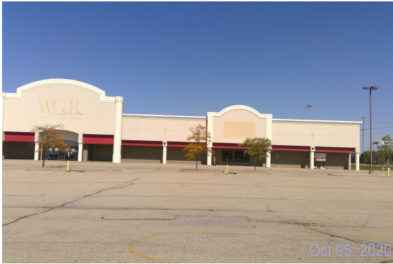
Property Detail for 31-7-0041-00