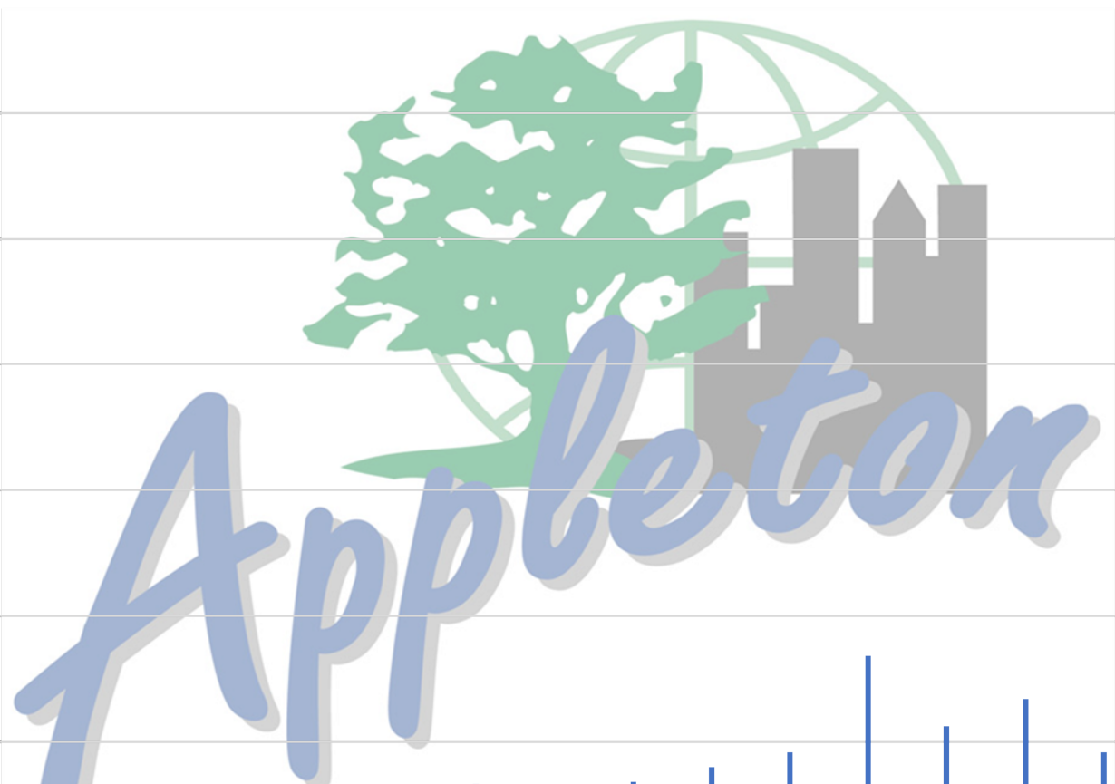
Newly Reported COVID-19 Cases in Appleton by Week, with an Average per Week

■ New Cases Last 7 Days — Weekly Average New Cases