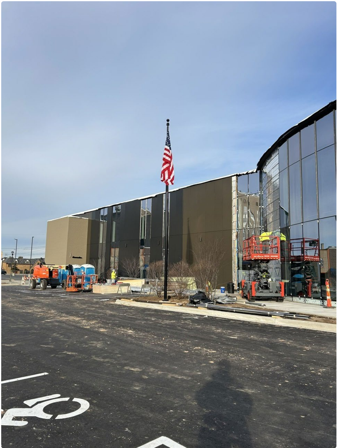
Flagpole and Front of Building