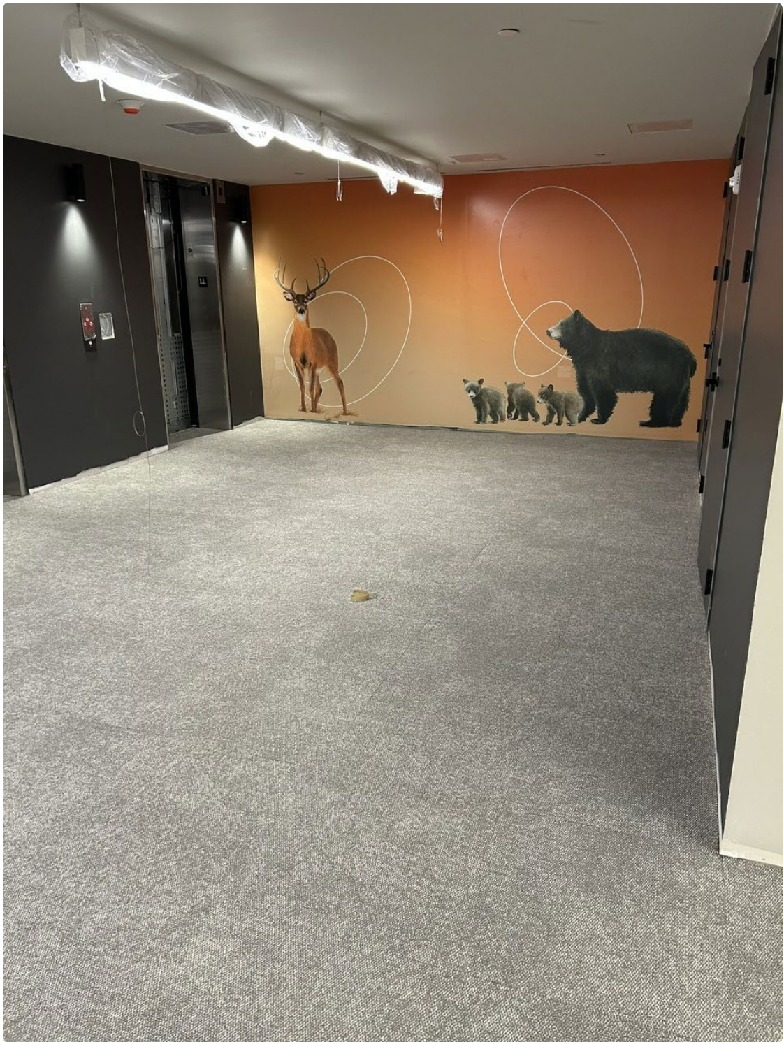
Lower-Level Wall Graphics