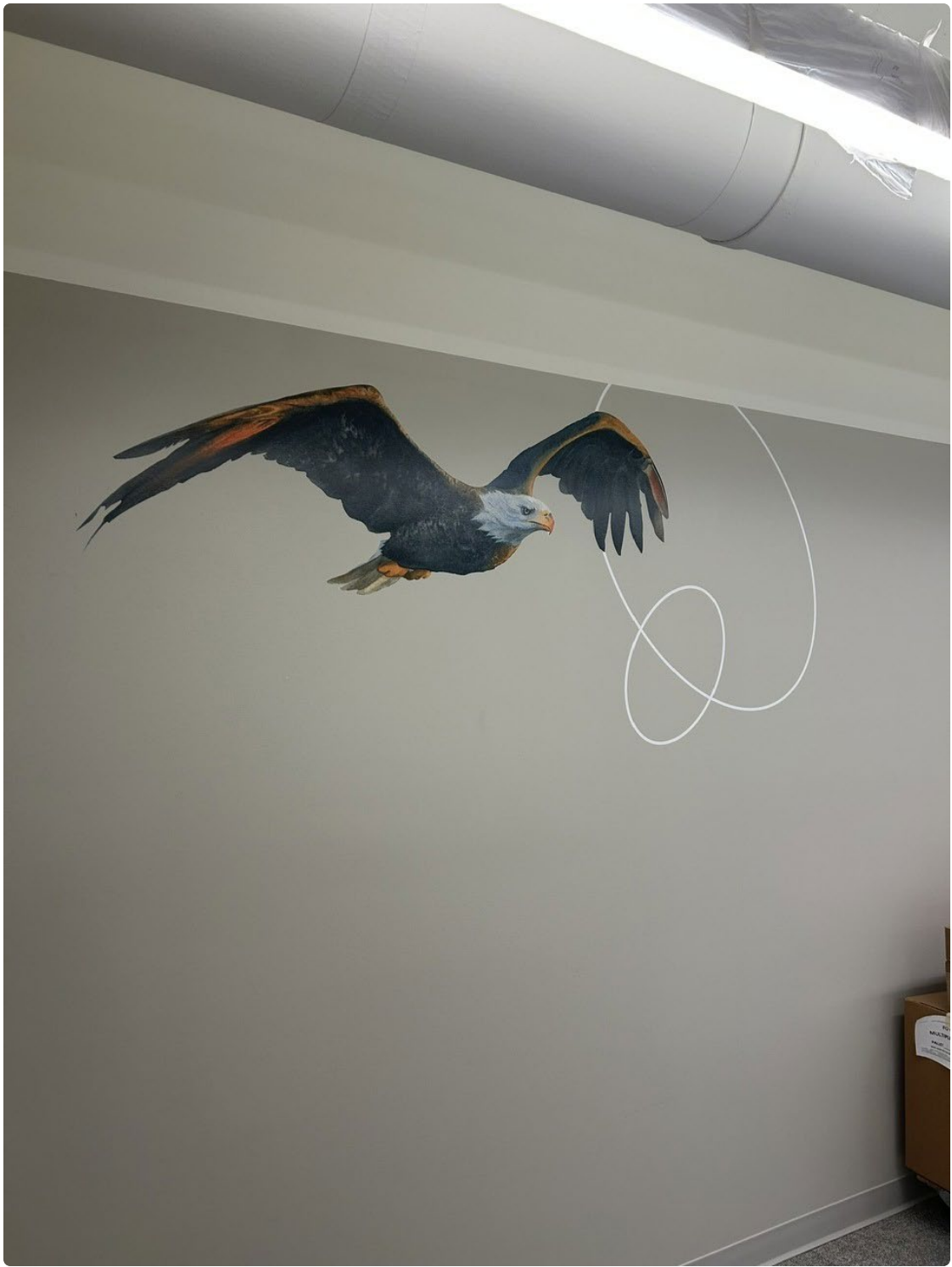
Lower-Level Wall Graphics