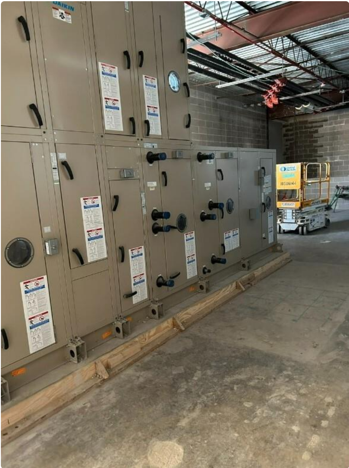
Upper-Level Air Handling Unit