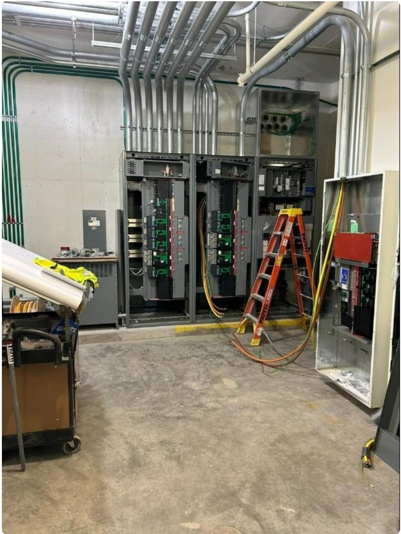
Lower-Level Data and Electrical Room