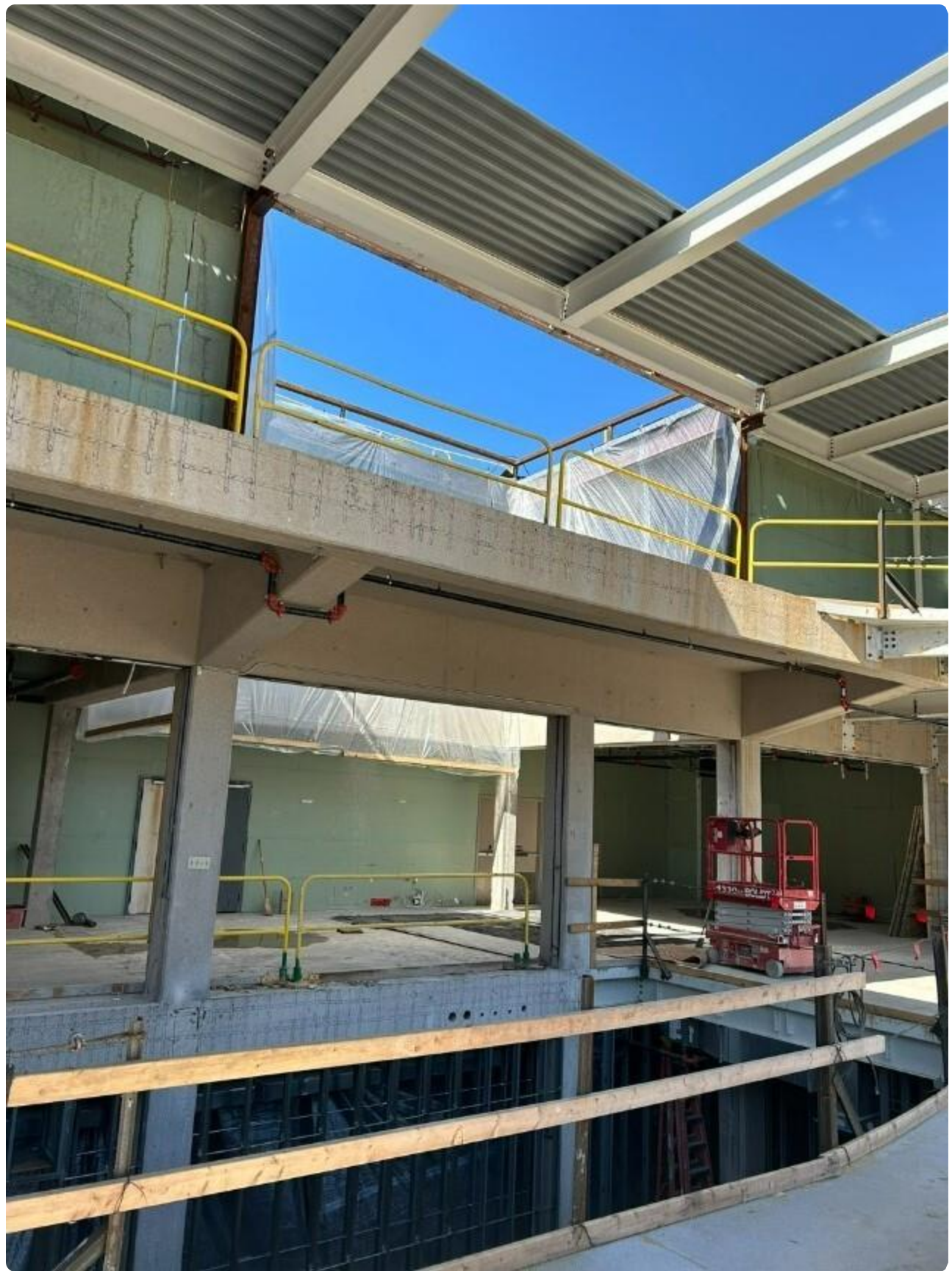
Main Skylight/Commons Area