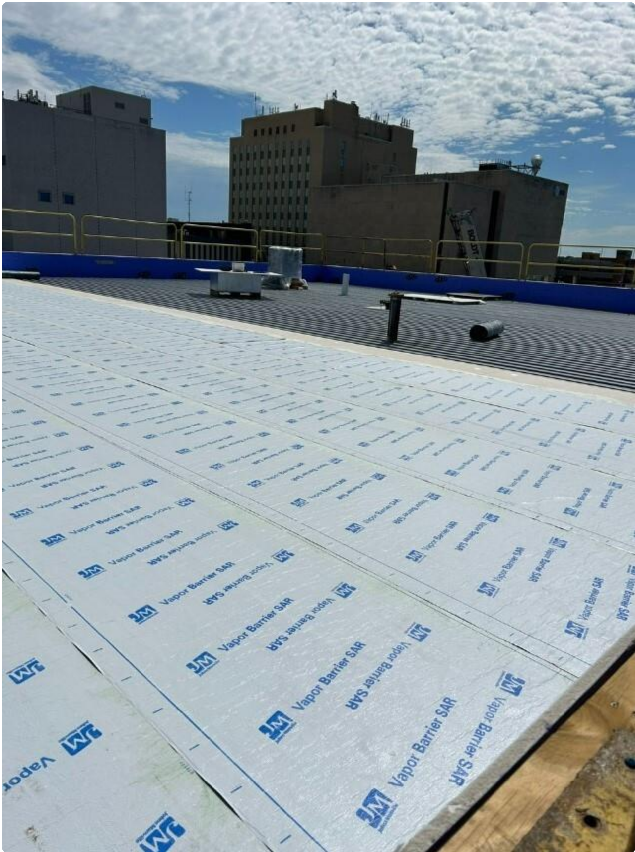
Upper-Level Community Meeting Room Roof