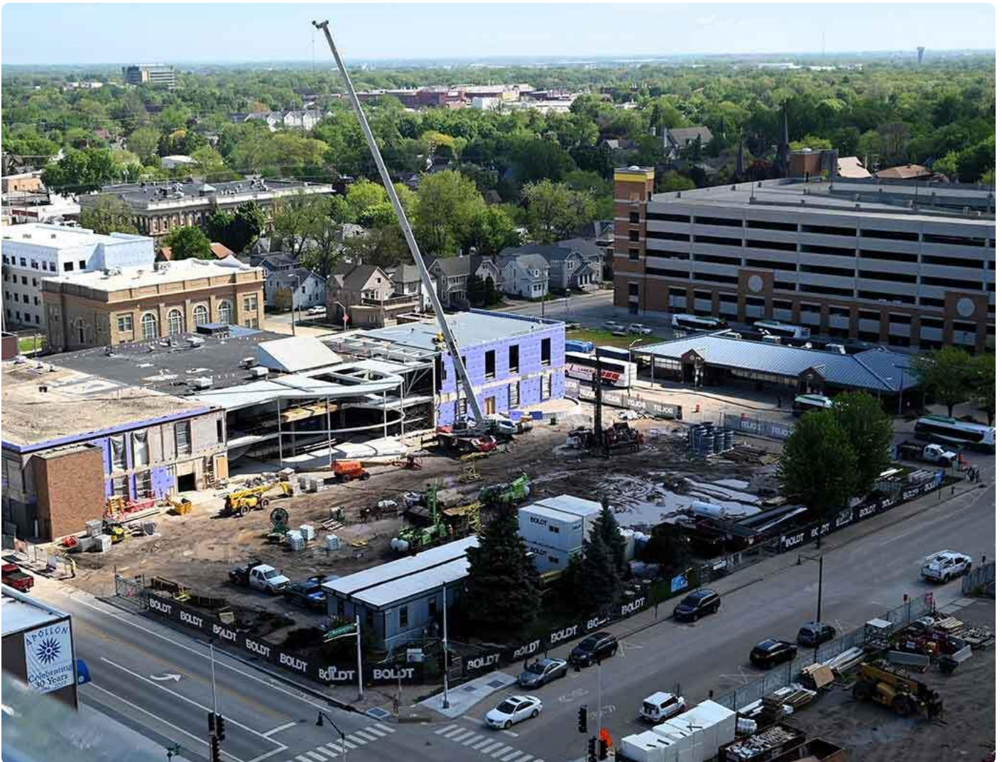
Exterior Southwest View

To learn more about the campaign and how you can participate, visit the Friends website .