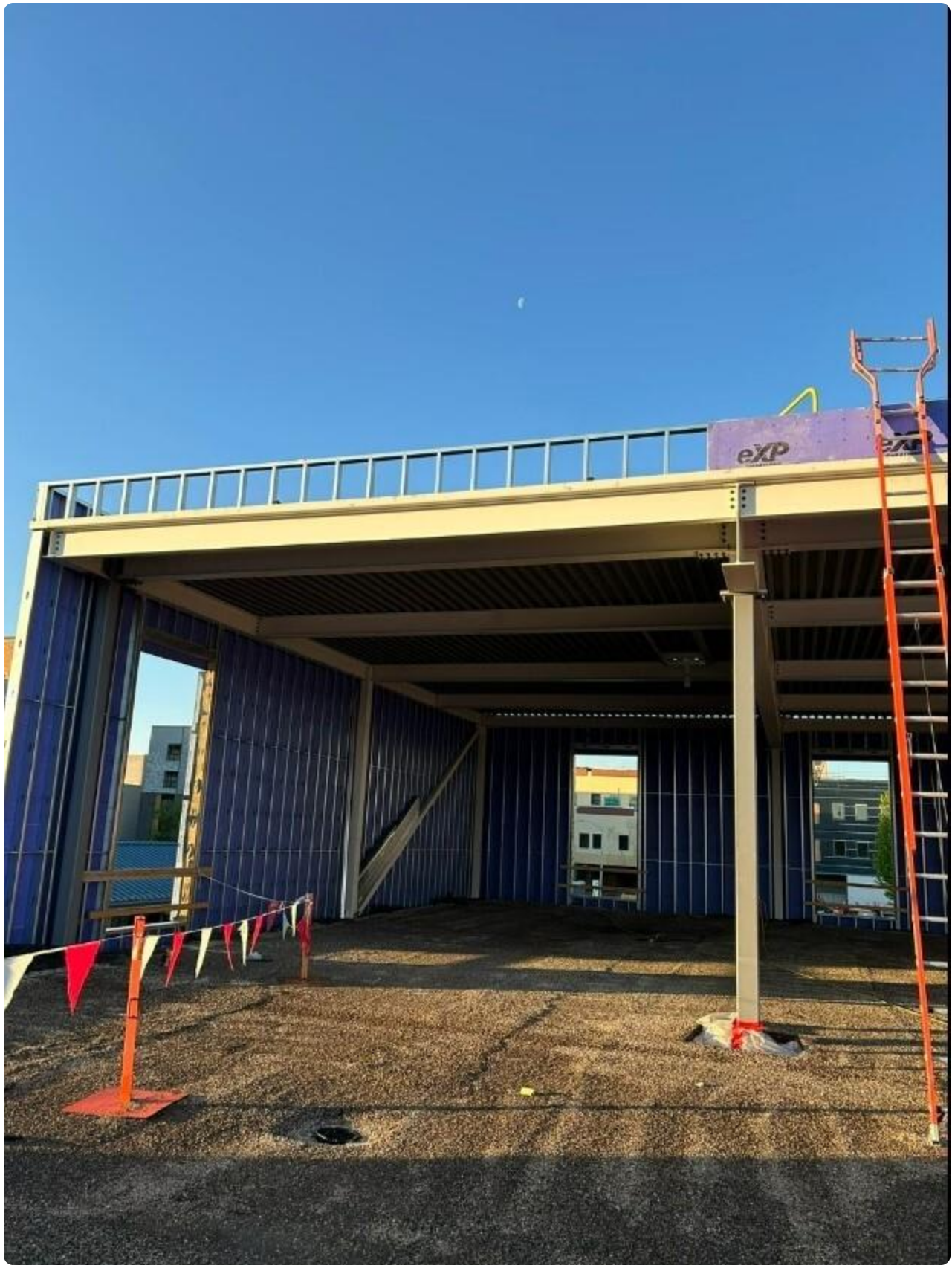
Upper-Level Community Meeting Room