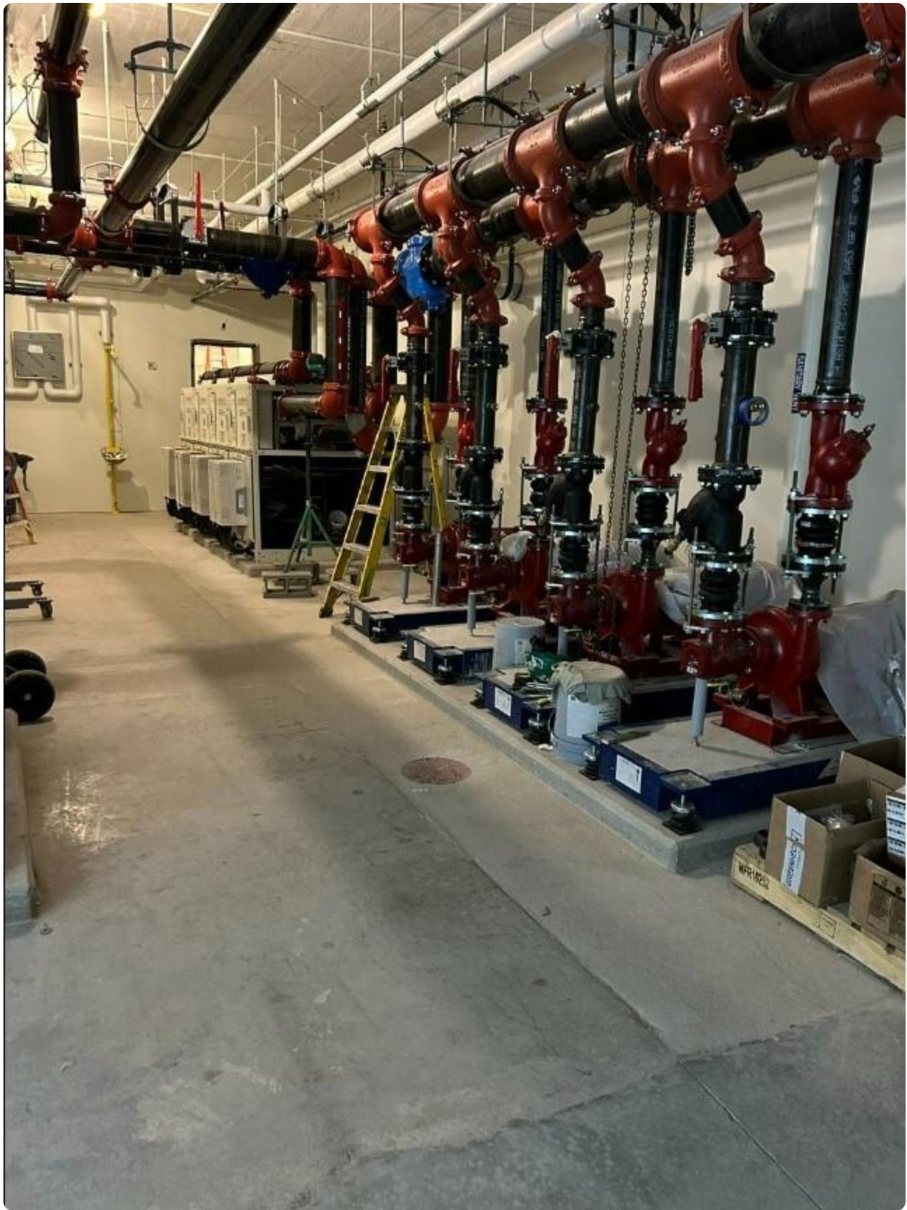
Geothermal Pump Room