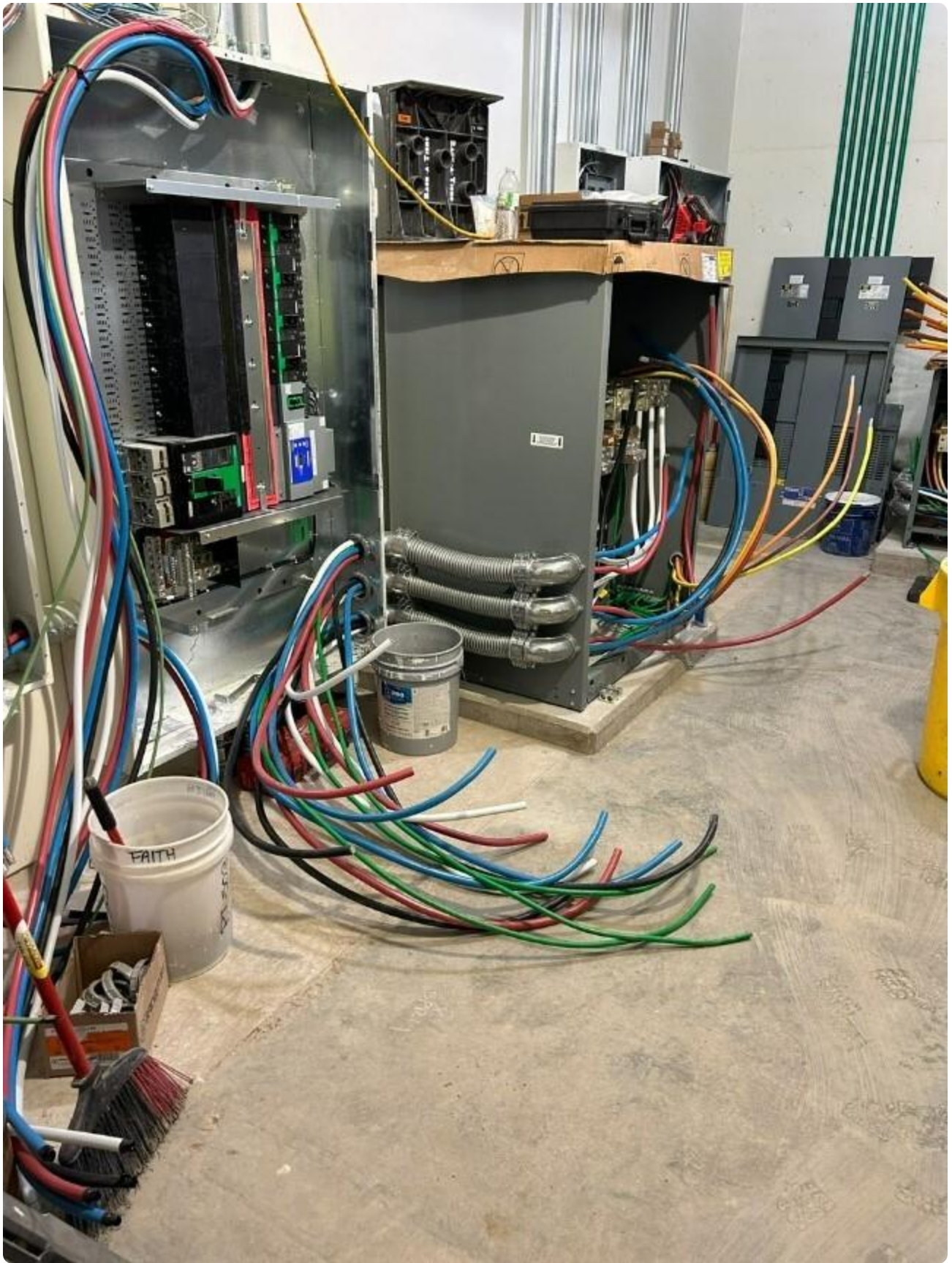
Lower-Level Data and Electrical Room