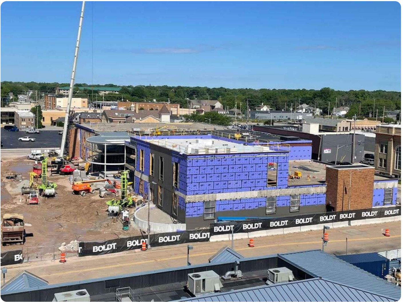
Exterior Southeast View