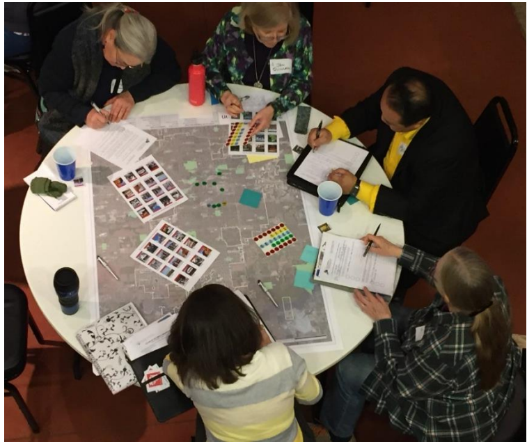
Figure 3 March 2016 Issues & Opportunities Workshop