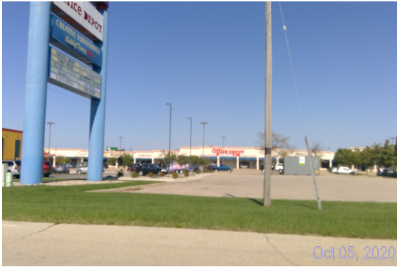
Property Detail for 31-7-0043-00