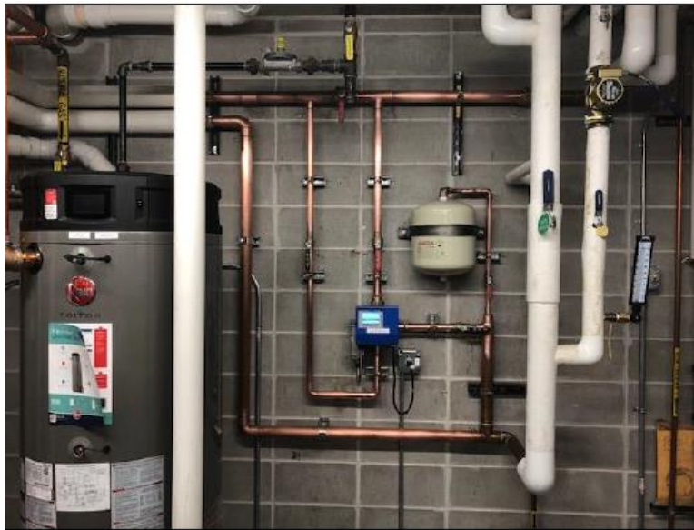
Police Station water heater, mixing valve, and piping replacement