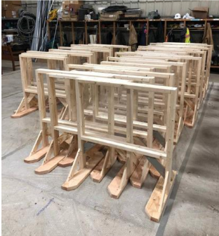
Voting barriers constructed for elections.