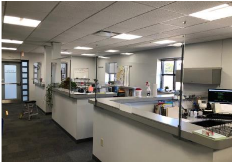
Social distancing barriers installed for MSB customer workstations.