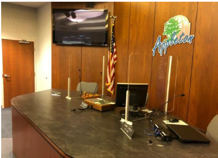
Social distancing barriers installed in the Council Chambers