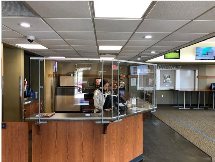
New Plexiglas installed at counter for staff and customer safety, similar sections were added in pro shop.