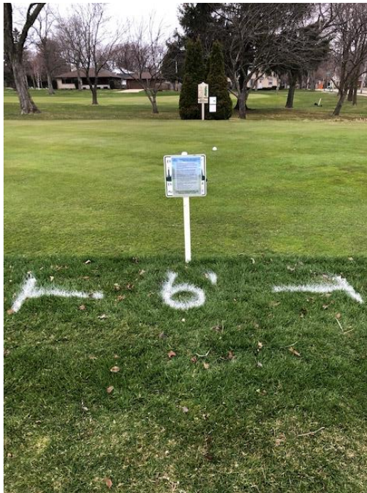
Opening day rules and 6' visual for golfer's awareness posted at #1 (pictured), 4, 7, 9, 10, 13 & 16 tees.