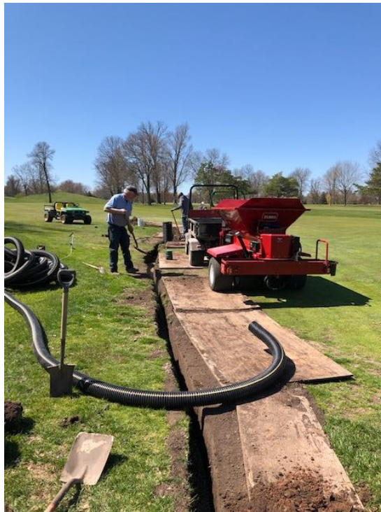
Utilizing the new topdresser/material hauler to back trench with pea gravel on #14.