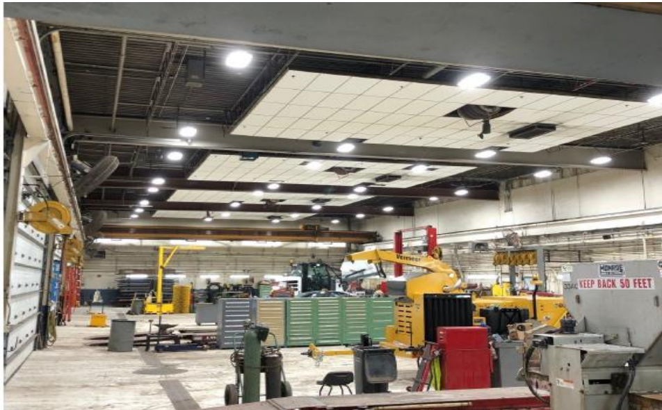
MSB CEA Mechanic Shop new LED fixtures installed