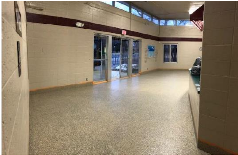
Mead Pool Bathhouse new epoxy flooring