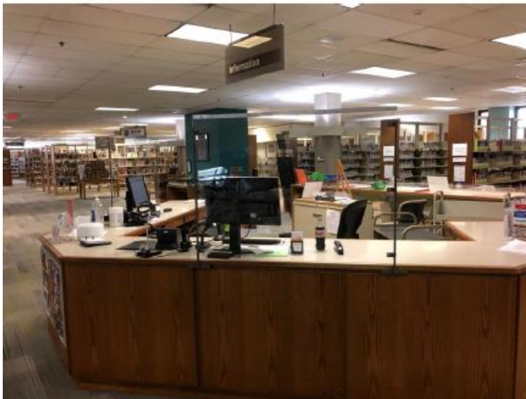
Social distancing barriers constructed and installed for Library service desks.