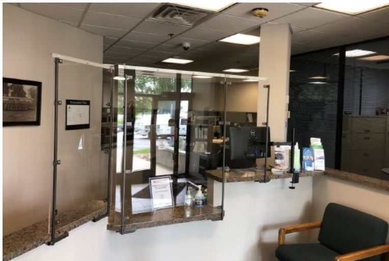
Social distancing barriers installed for Valley Transit