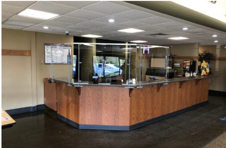
Social distancing barriers installed for Golf Course Clubhouse food and beverage service