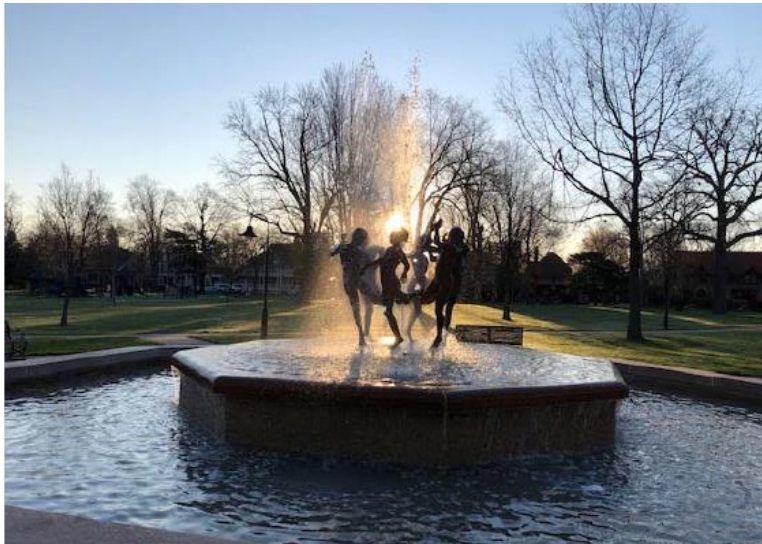
City Park fountain turned on in April