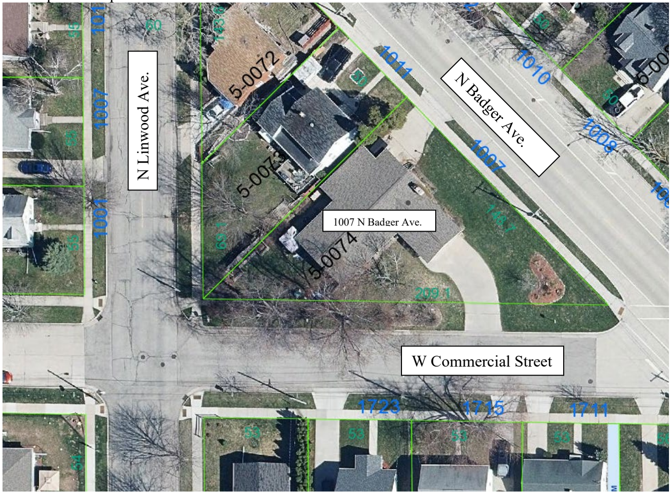
Aerial parcel map.