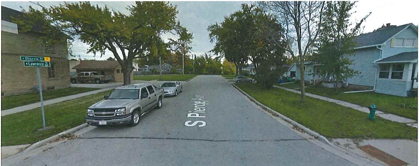
200 Pierce Avenue, looking south from Lawrence Street.

Our office was contacted by a resident on the 200 block of S. Pierce Avenue, concerned about the lack of street lighting on their block. This block is a short block, bordered by Lawrence Street on the north and the railroad tracks on the south. There is an existing street light located at the intersection of Lawrence Street and Pierce Avenue. There is also an existing street light located at the intersection of Eighth Street and Pierce Avenue. This spacing would be typical if the street was continuous, but the railroad tracks and large trees prevent the existing lighting from being effective, especially just north of the tracks.