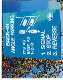
Example of an instructional sign.

No. The transition would be aided with signs and other markings to clarify the appropriate use of these parking spots. At first, “seed” cars could also be parked in a few spots to provide a visual example of the correct way to park.